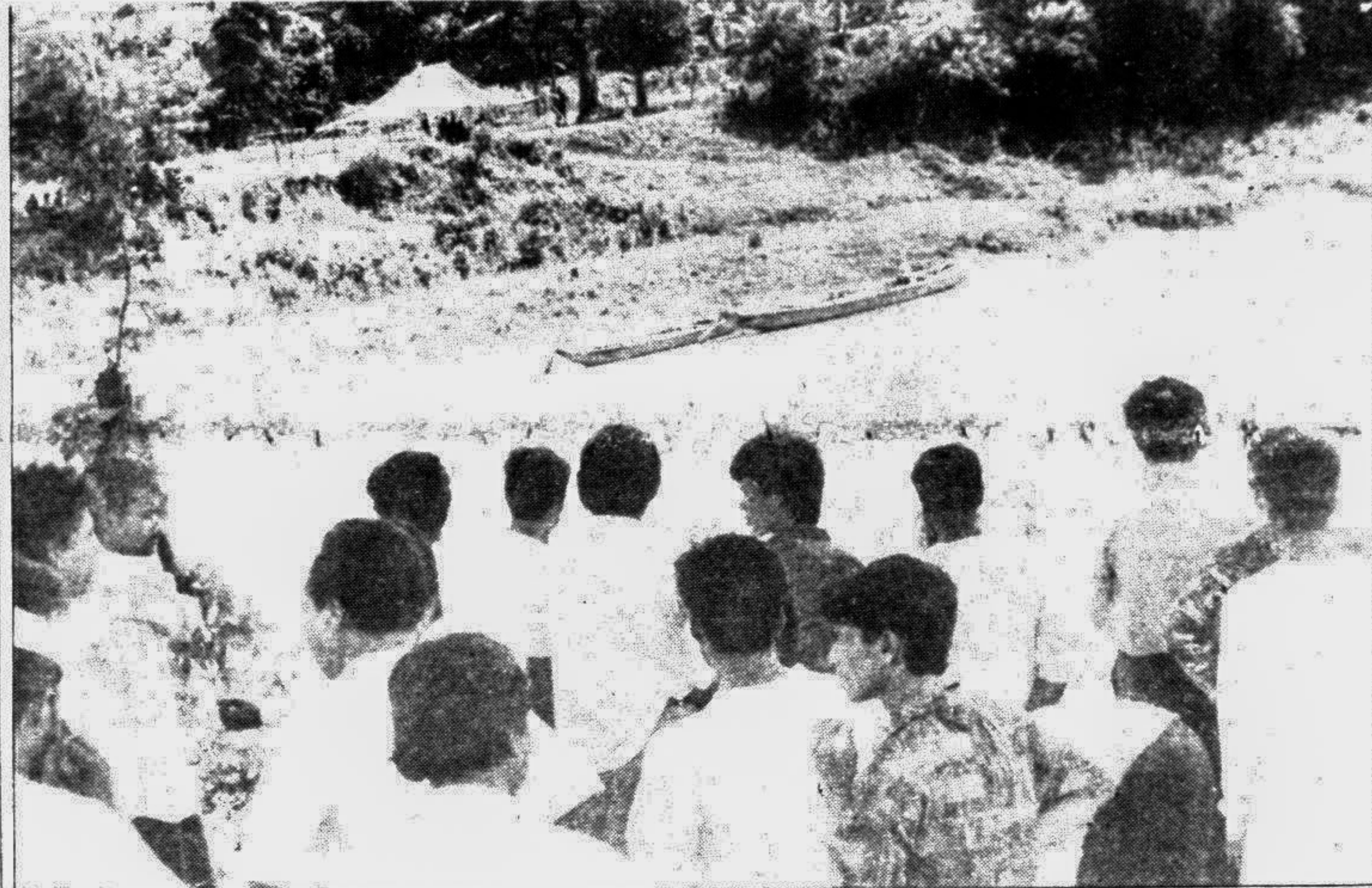
A WAIT IN VAIN: Officials, newsmen and relatives look eagerly across the Feni river for the repatriation of the first batch of Chakma refugees from the Indian state of Tripura at the Ramgarh reception camp Khagrachhari, yesterday. Despite their keen, patient vigil none of the refugees bothered to cross the 100-yard river into Bangladesh.

Similar arrangements for repatriation were also made in January when her engagement to the Crown Prince was officially announced.