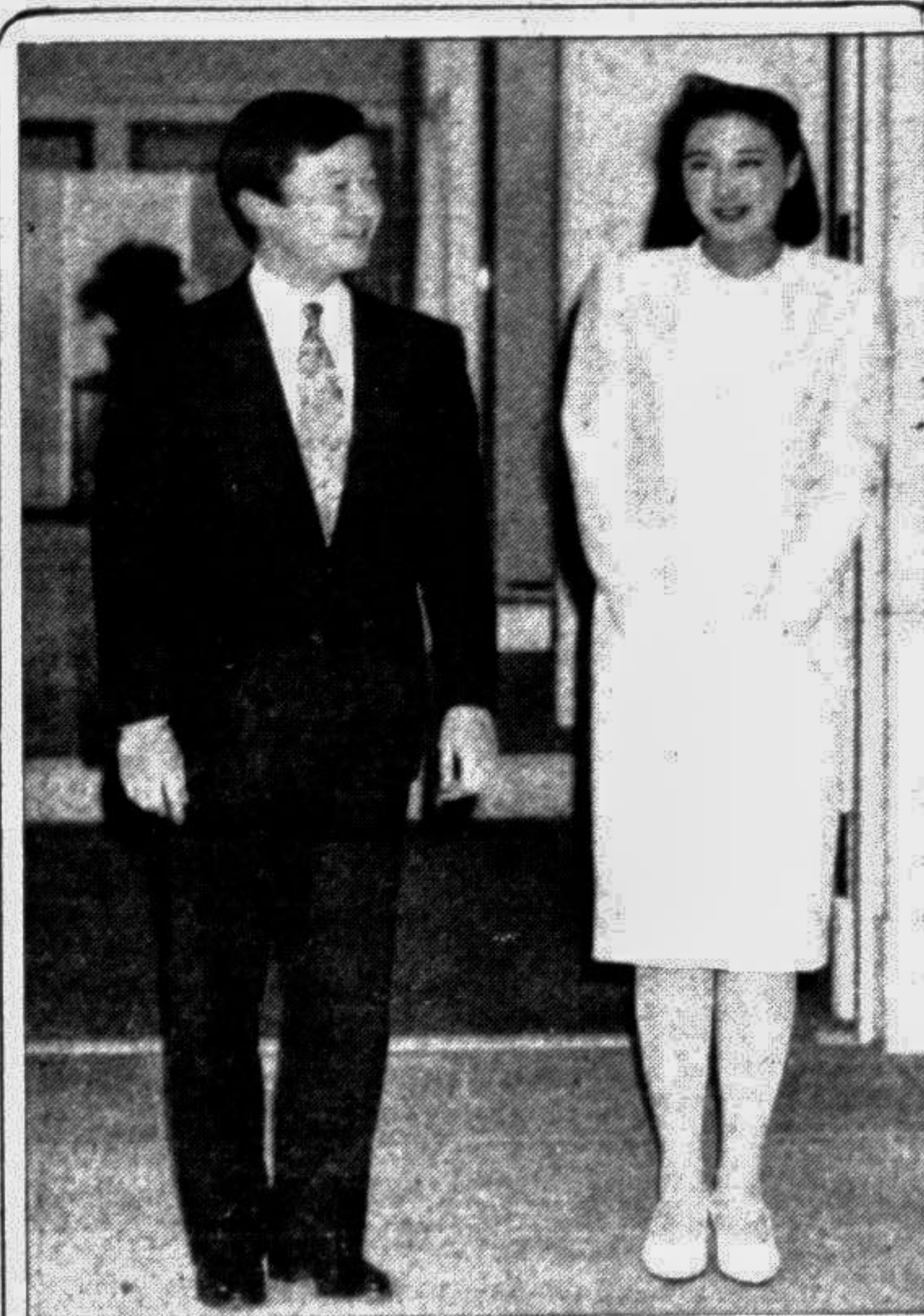
Japan's Crown Prince Naruhito and his fiancée Masako Owada