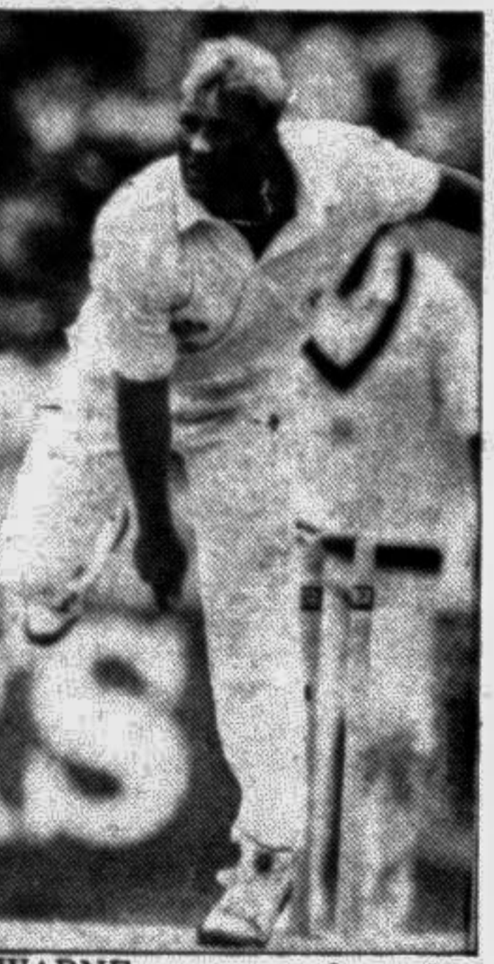
WARNE... man of match

MANCHESTER, June 7: Leg-spinner Shane Warne and paceman Merv Hughes shared eight wickets as Australia triumphed by 179 runs over England in the first Ashes Test at Old Trafford today, reports Reuter.