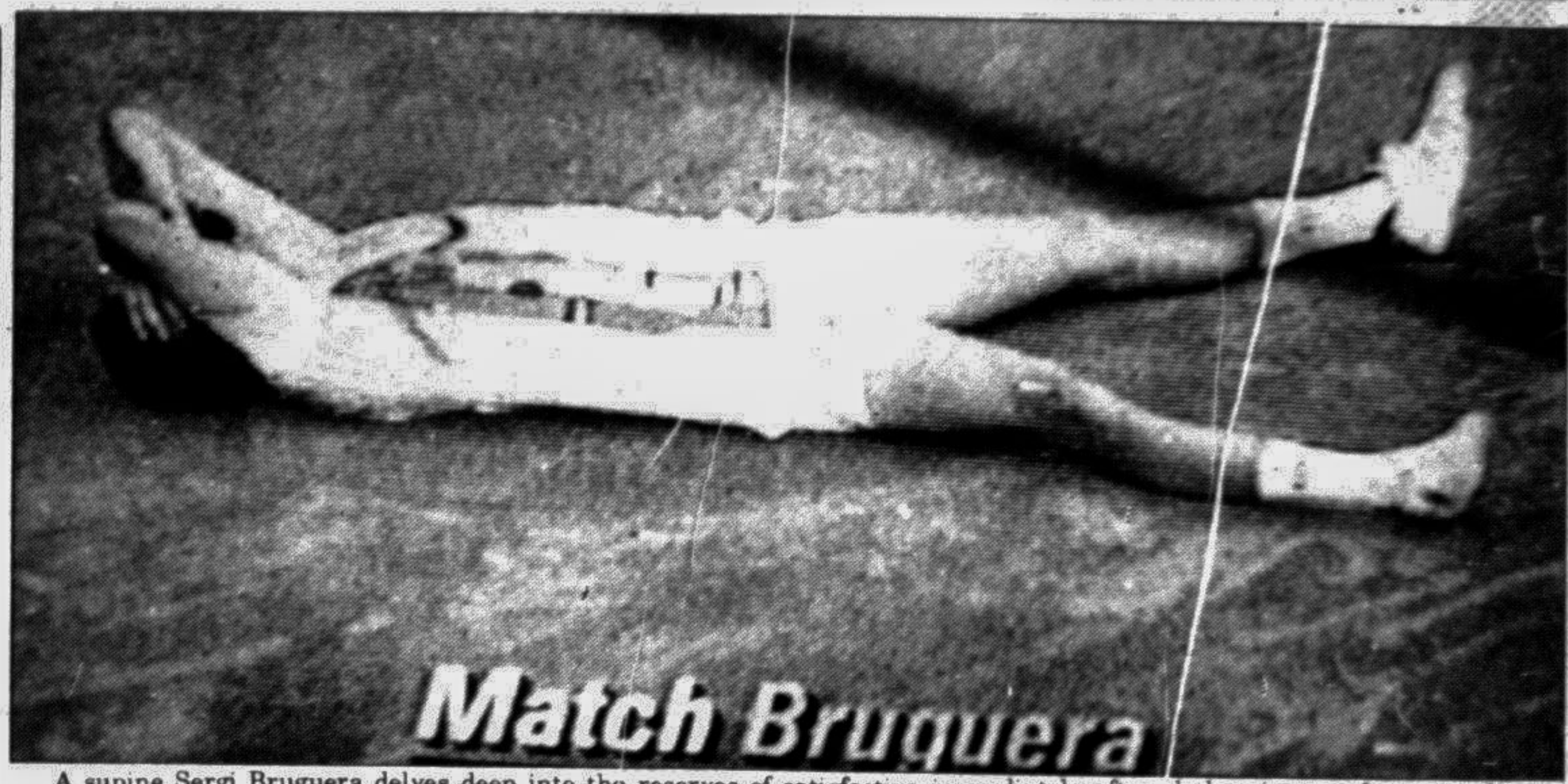
A supine Sergi Bruguera delves deep into the reserves of satisfaction immediately after dethroning top favourite Jim Courier in the final of the French Open at Roland Garros on Sunday. The Spaniard clinched the five-setter to have the first Grand Slam of his life.