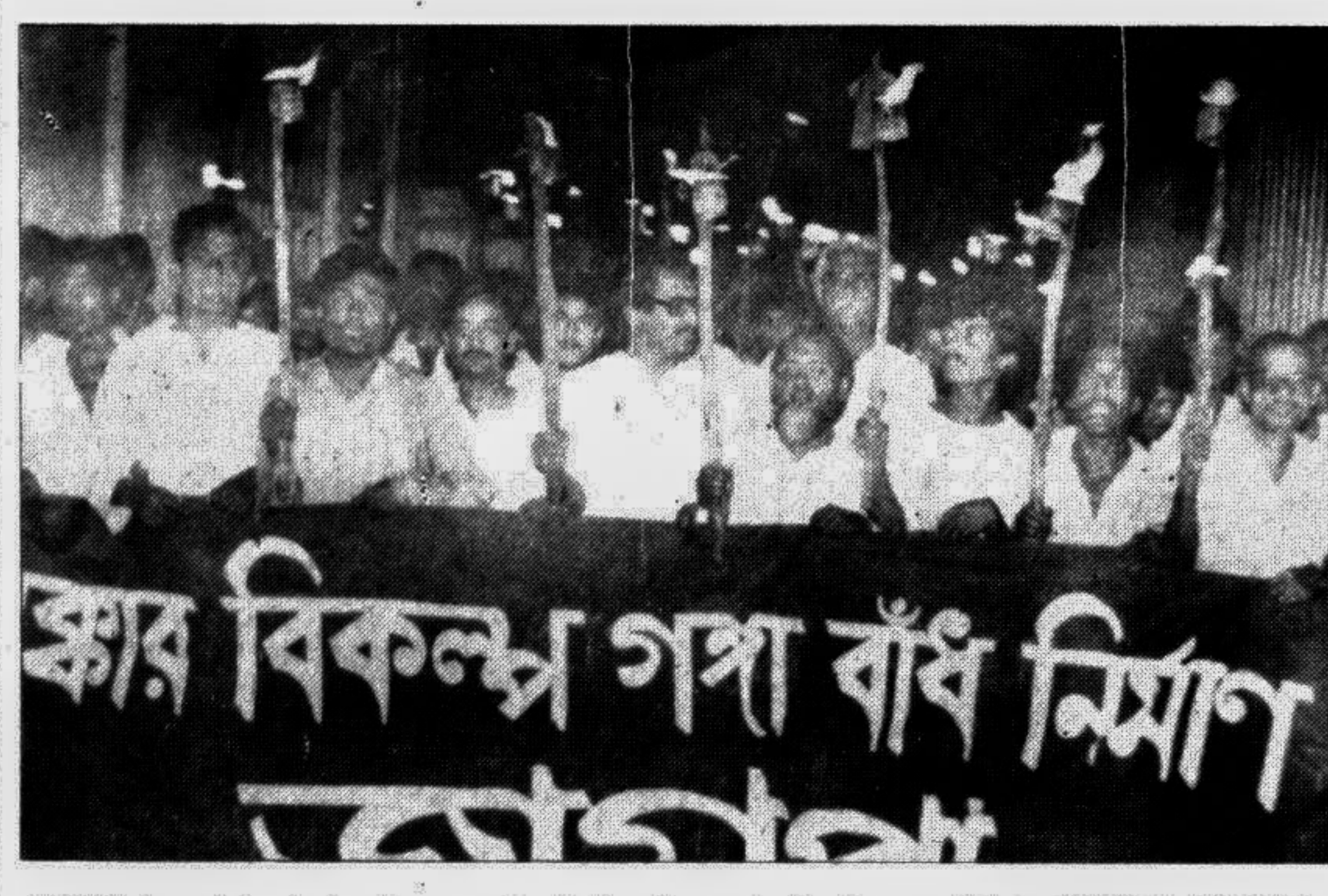
JAGPA brought out a torch procession in the city yesterday to press for construction of Ganges Barrage as an alternative to Farakka Barrage.