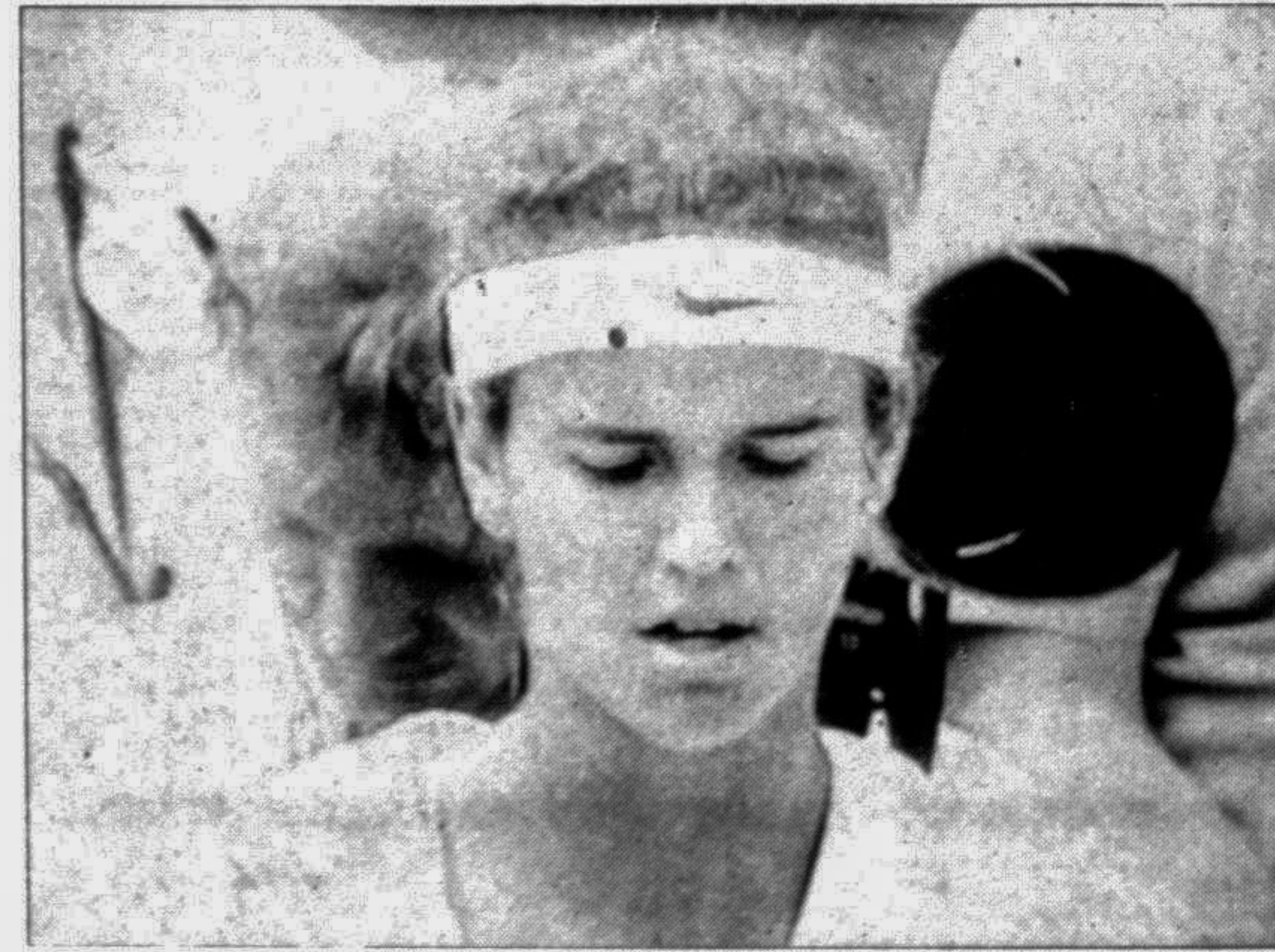
Mary Joe Fernandez, who gave rise to hopes of an upset in the final with some inspired tennis takes a break against Graf in the women's final of French Open yesterday. Steffi's experience finally prevailed over Mary's exuberance at Roland Garros.

Campese, who made decisive moves in Saturday's match in this northern city, said after victory it was his last game in Italy following ten seasons with Italian clubs.