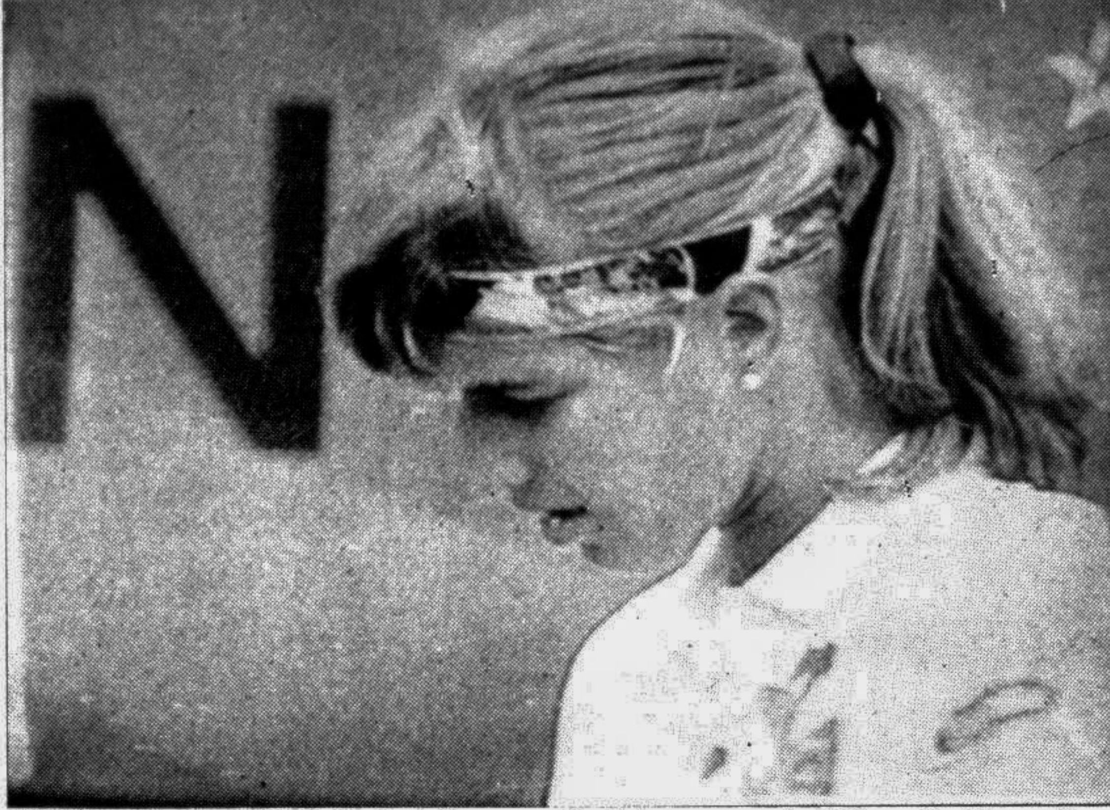
World number one Steffi Graf of Germany about to serve against Mary Joe Fernandez in women's final of the French Open yesterday at Roland Garros. The German celebrated her return to number one spot in ATP ranking by winning her 3rd French Open title.

PARIS, June 5: Battling back like a champion, Steffi shook off a slow start to end the upset streak of Mary Joe Fernandez and win her third French Open title Saturday, reports AP.