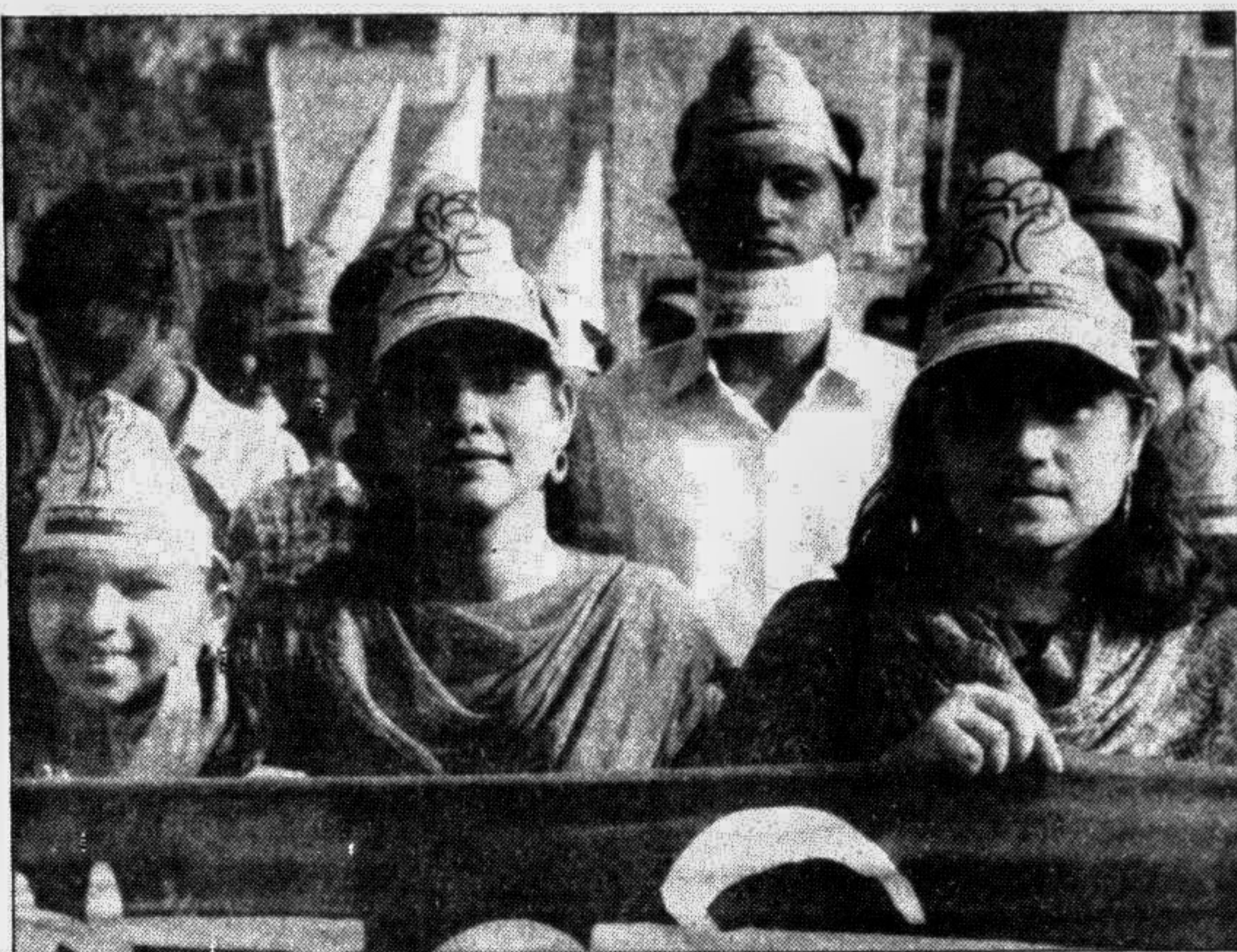
A colourful procession organised by the Ministry of Environment and Forest was brought out in the city yesterday in observance of the World Environment Day.