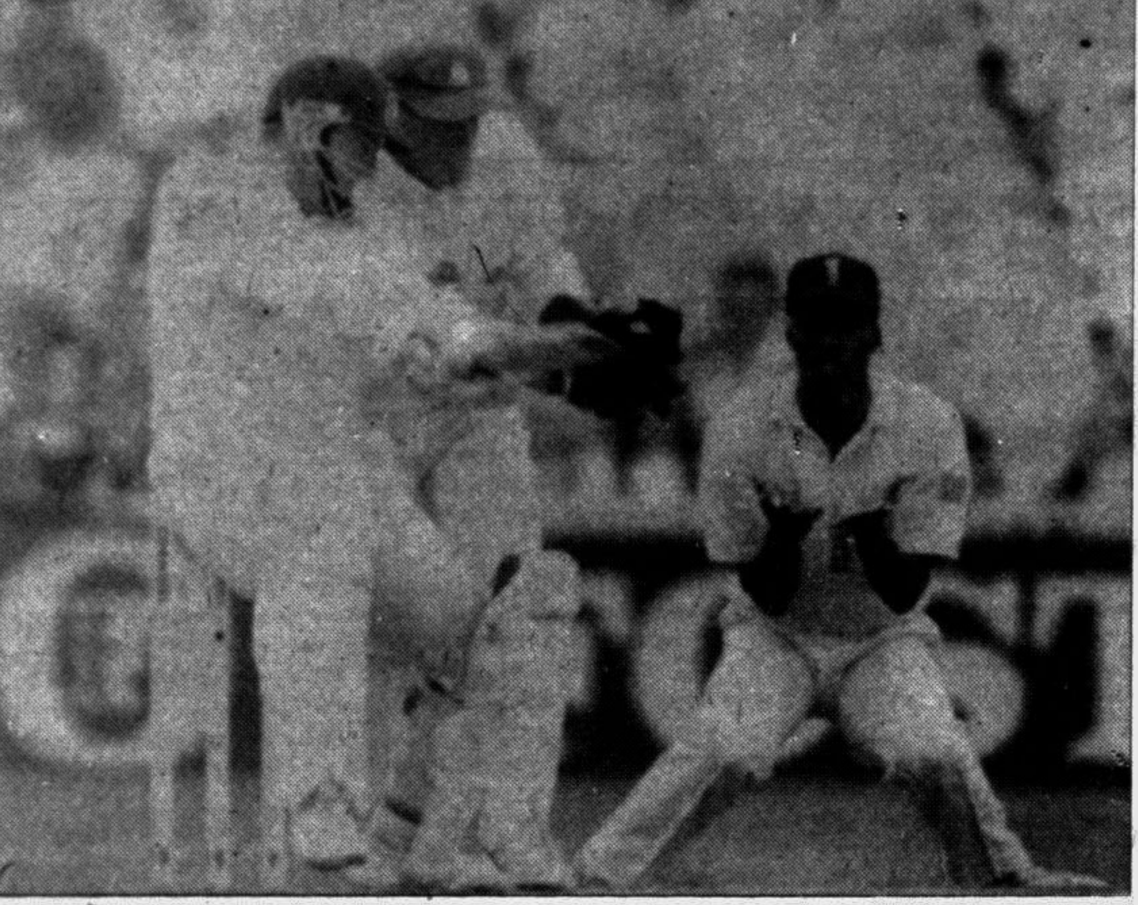
Mark Taylor, the top scorer in Australia's first innings, cuts Peter Such on the first day of the first Test between England and Australia at Old Trafford, Manchester on June 3. The southpaw topscorer scored with 124.

SCOREBOARD Scoreboard on the second day of the first Test between England and Australia at Old Trafford on Friday: AUSTRALIA: First Innings (overnight 242-5) M Taylor c and b Such 124 M Slater c Stewart 124 b DeFreitas 58 D Boon c Lewis b Such 21 M Waugh c and b Tufnell 6 A Border st Stewart b Such 17 S Waugh b Such 3 I Healy c Such b Tufnell 12 B Julian c Gatting b Such 0 M Hughes c DeFreitas b Such 2 S Warne not out 15 C McDermott run out 8 Extras: (b-8, lb-8, nb-7) 23 Total: 289 Fall of wickets: 1-128; 2-183; 3-221; 4-225; 5-232; 6-260; 7-264; 8-266; 9-267; Bowling: O M R W Caddick 15 4 38 0 DeFreitas 23 8 46 1 Lewis 13 2 44 0 Such 33.3 9 67 6 Tufnell 28 5 78 2 ENGLAND: First Innings G Gooch c Julian b Warne 65 M Atherton c Healy 19 b Hughes 4 R Smith c Taylor b Warne 4 G Hick c Border b Hughes 34 A Stewart b Julian 27 C Lewis c Boon b Hughes 9 P DeFreitas lbw b Julian 5 A Caddick not out 6 P Such not out 9 Extras: (b-5, lb-10, nb-5) 20 Total: (for eight wickets) 202 Fall of wickets: 1-71; 2-80; 3-84; 4-123; 5-148; 6-168; 7-178; 8-183. To bat: P Tufnell BOWLING: O M R W McDermott 18 2 50 0 Hughes 17 5 52 4 Julian 11 2 30 2 Warne 21 7 51 3 Border 1 0 4 0