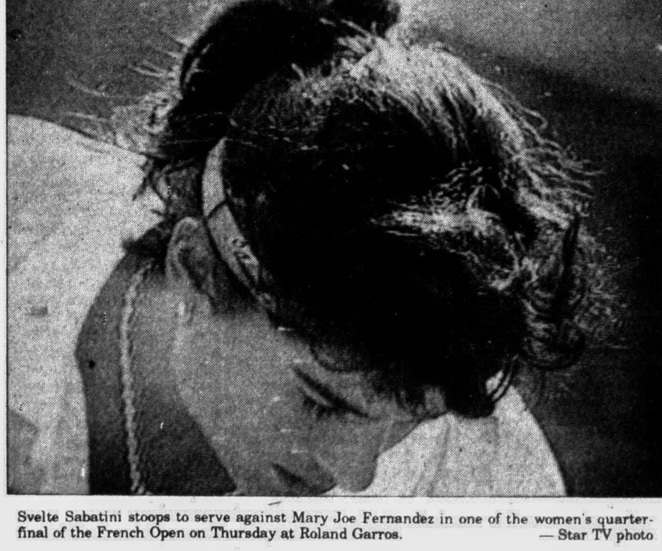
Svelte Sabatini stoops to serve against Mary Joe Fernandez in one of the women's quarter-final of the French Open on Thursday at Roland Garros.