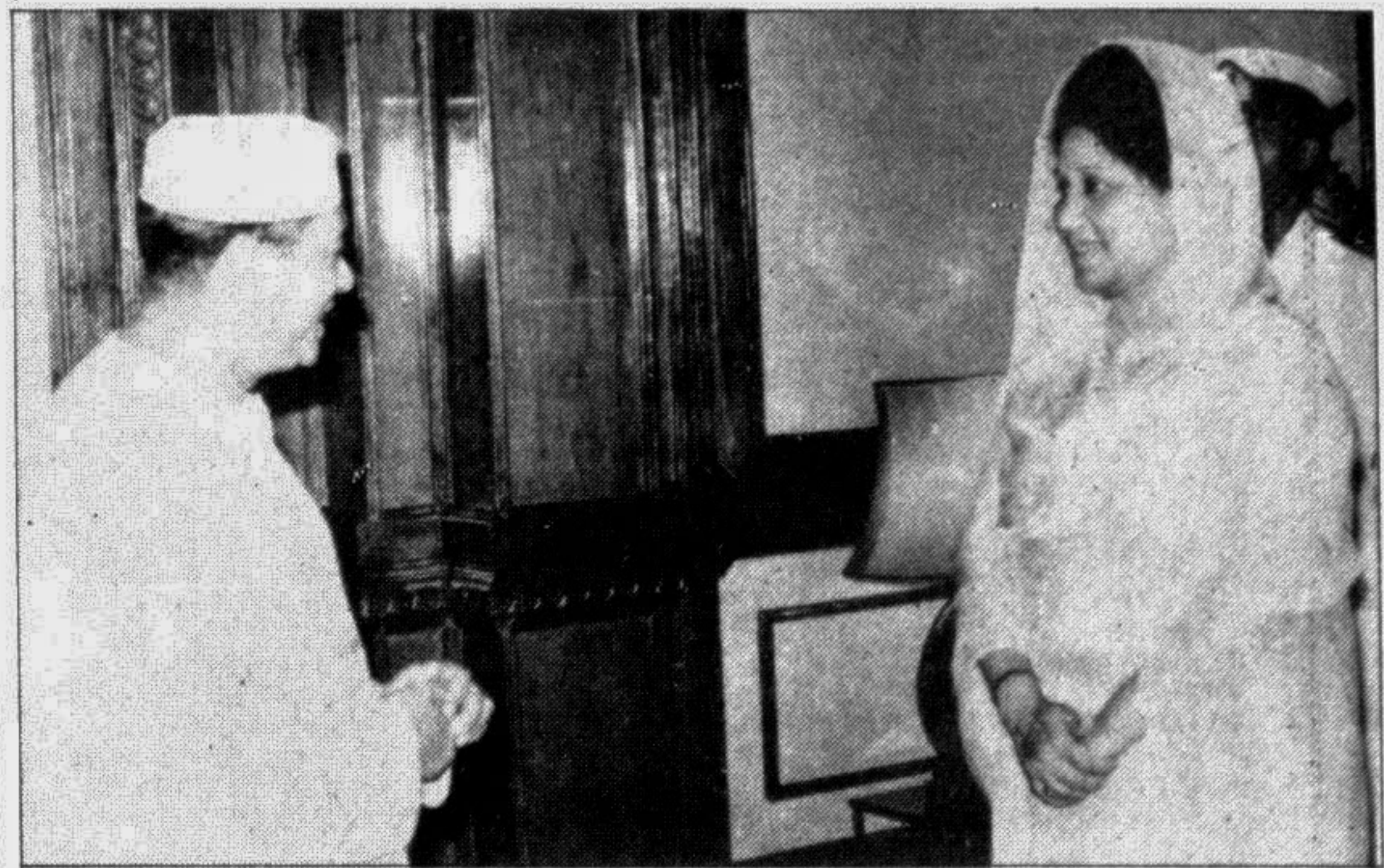
Prime Minister Begum Khaleda Zia exchanging Eid greetings with the Chief of Army Staff Lieutenant General Mohammad Noor Uddin Khan at her Sugandha office on Wednesday.