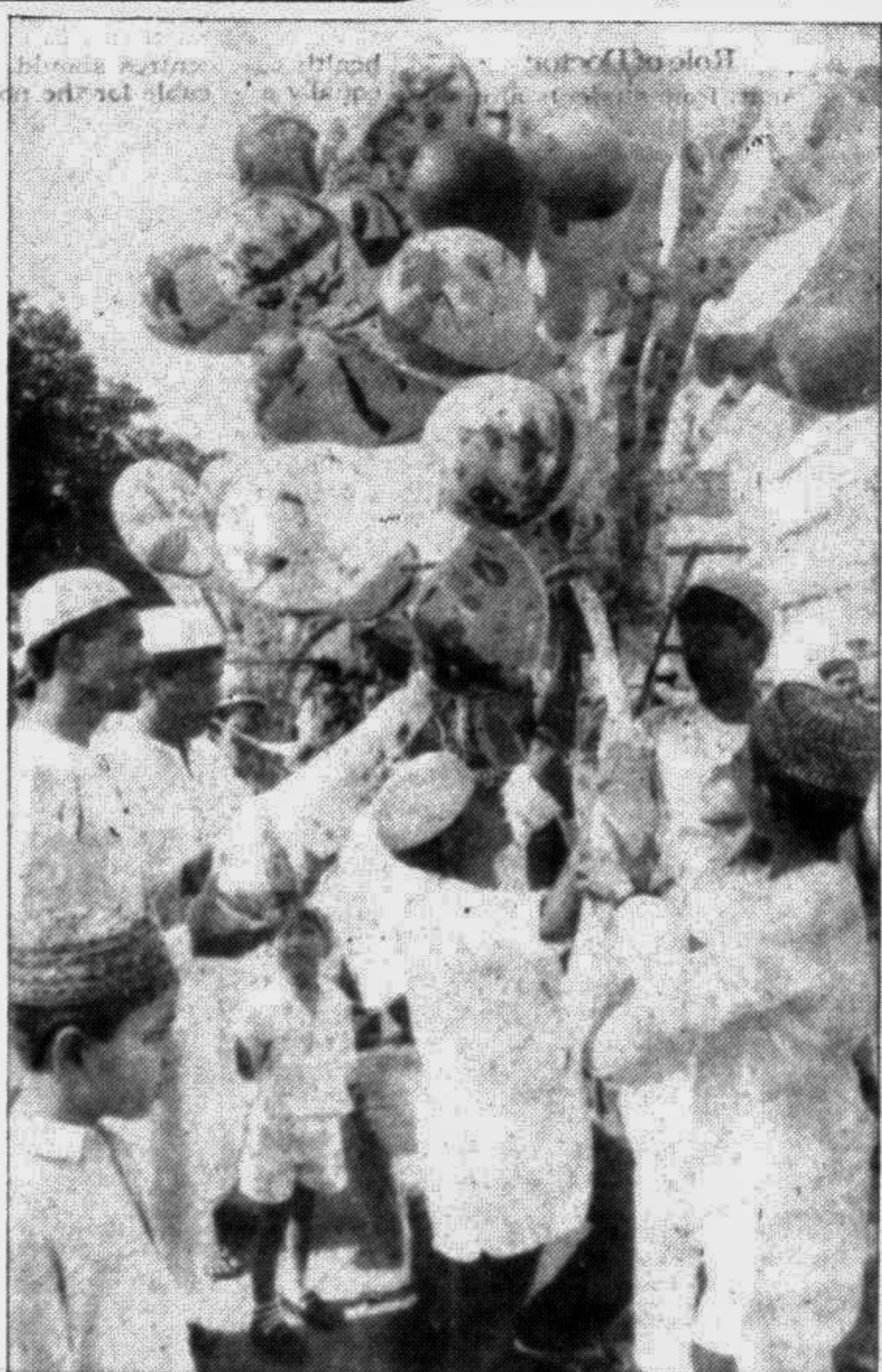
Children purchasing colourful balloons on Eid day in the city.