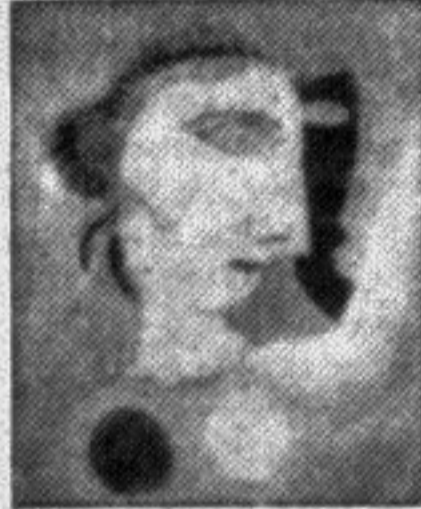
An Extravaganza of Art Pieces Page 3