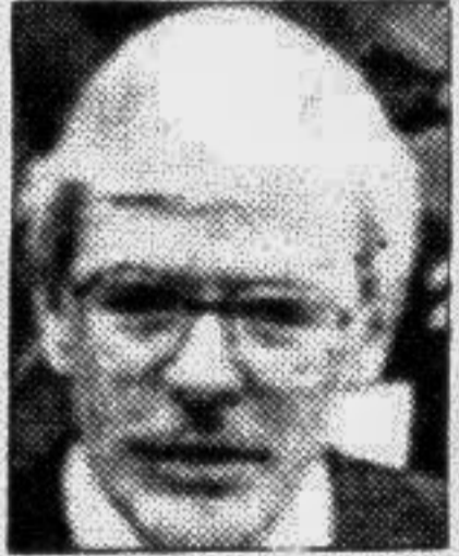
John Major most unpopular Prime Minister Page 5

UN set to approve sending more troops to Bosnia