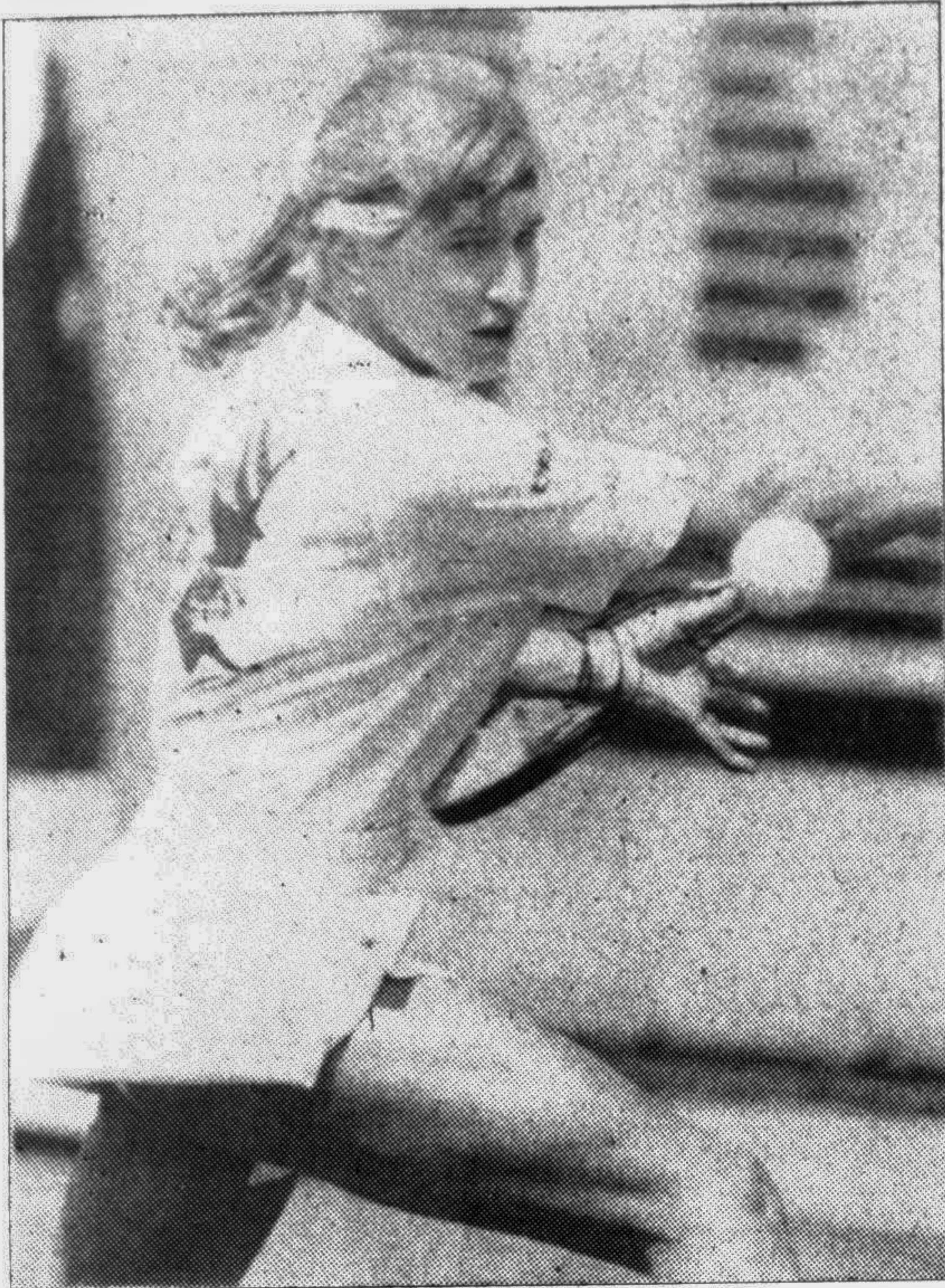
Top seed Steffi Graf of Germany about to make a backhand return during her fourth round match against Croatian teenage sensation Iva Majoli in the French Open at Roland Garros on May 30. Graf advanced to the quarter-finals with a hard-earned 6-4, 7-6 victory.