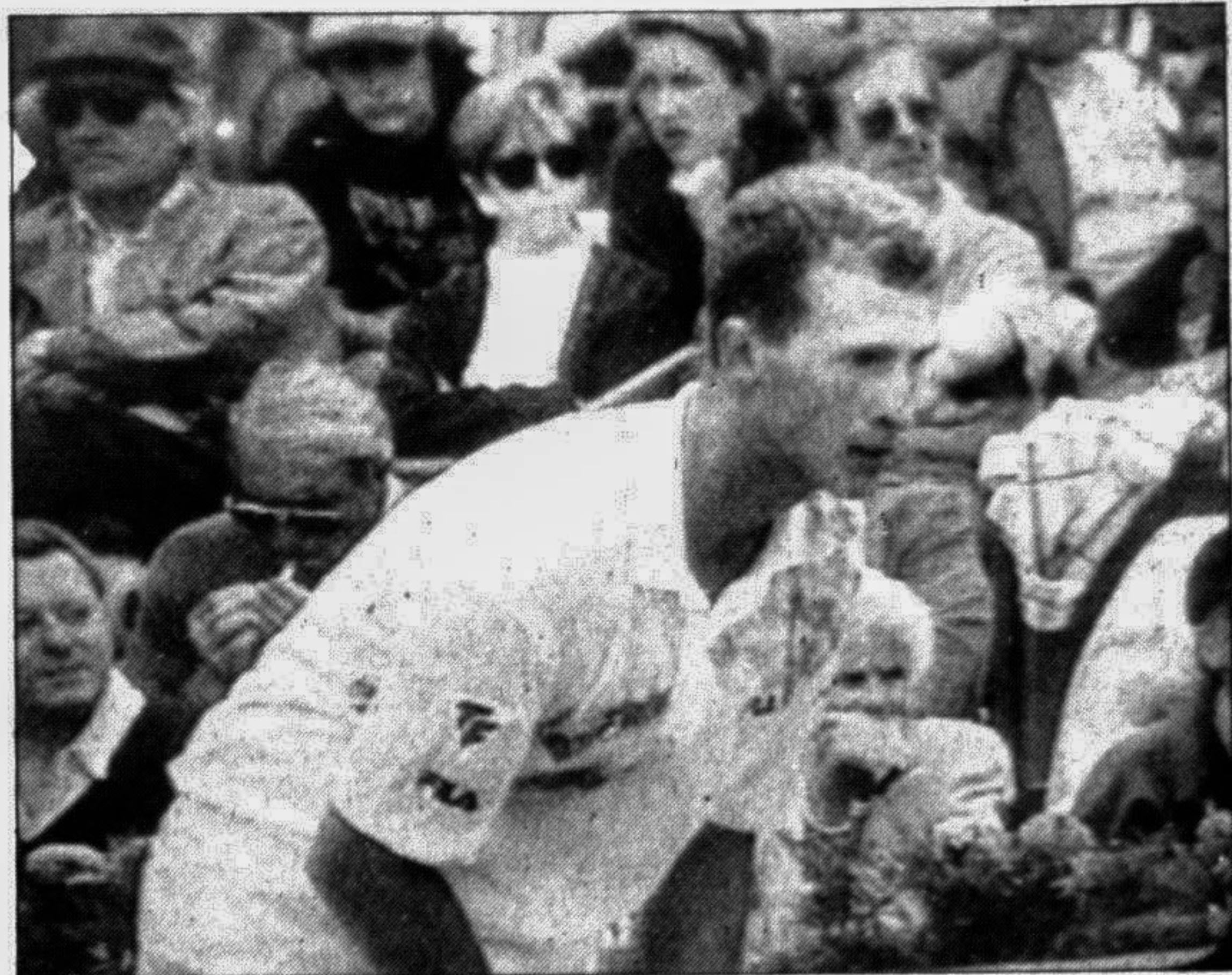
Ukrainian Andrei Medvedev awaits German Marc Goellner's serve during their fourth round match of the French Open yesterday. Medvedev slammed 14 aces to win the tie 6-4, 6-4, 4-6, 6-3.

"I don't think I'm going to burn out," she said. "I don't know how long I'll play. If I'm not enjoying it at 25 or 23 I'm