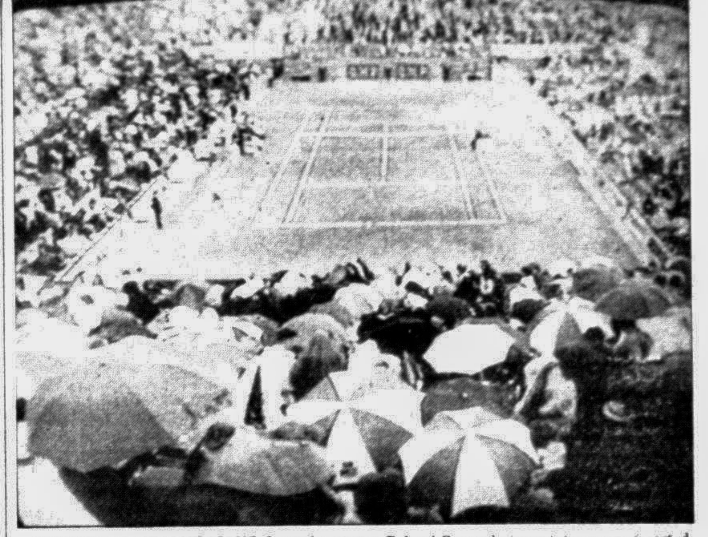
A WIMBLEDONESQUE SIGHT: It rarely rains at Roland Garros but spectators were resorted to umbrellas when steady drizzle disrupted yesterday's proceedings of the French Open twice.

During the match, that ended in a 1-1 tie, police in riot gear had to remove misbehaving Polish fans who were throwing sticks at each other.