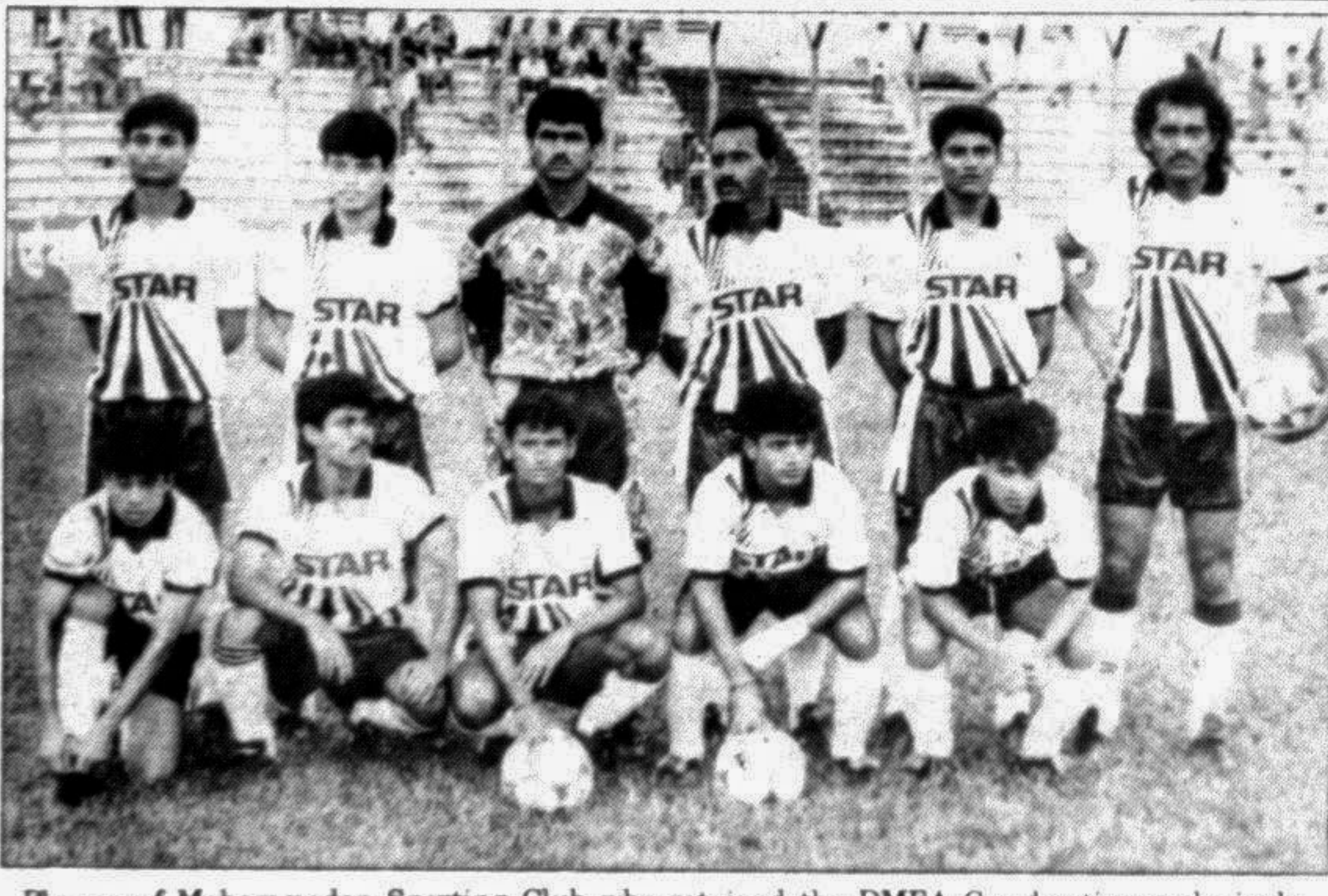
Players of Mohammedan Sporting Club who retained the DMFA Cup beating arch-rivals Abahani Krira Chakra 3-2 in the final at the Dhaka Stadium yesterday. Mohammedans won the first DMFA Cup title in 1984 with Brothers Union.

Inter drew their match with Foggia 1-1 last Sunday, conceding a late goal after De Agostini had been sent off.