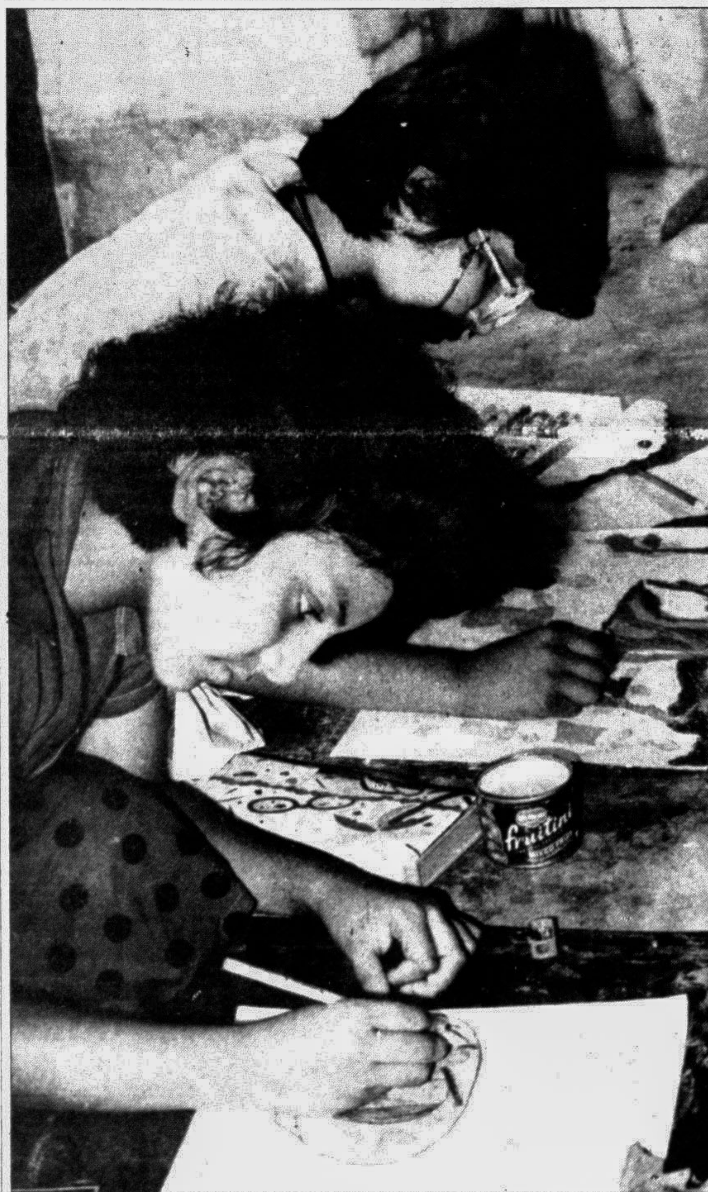
A drawing competition for children was held at the auditorium of the Teachers' Training College yesterday to mark the 17th anniversary of death of Shilpacharya Zainul Abedin.