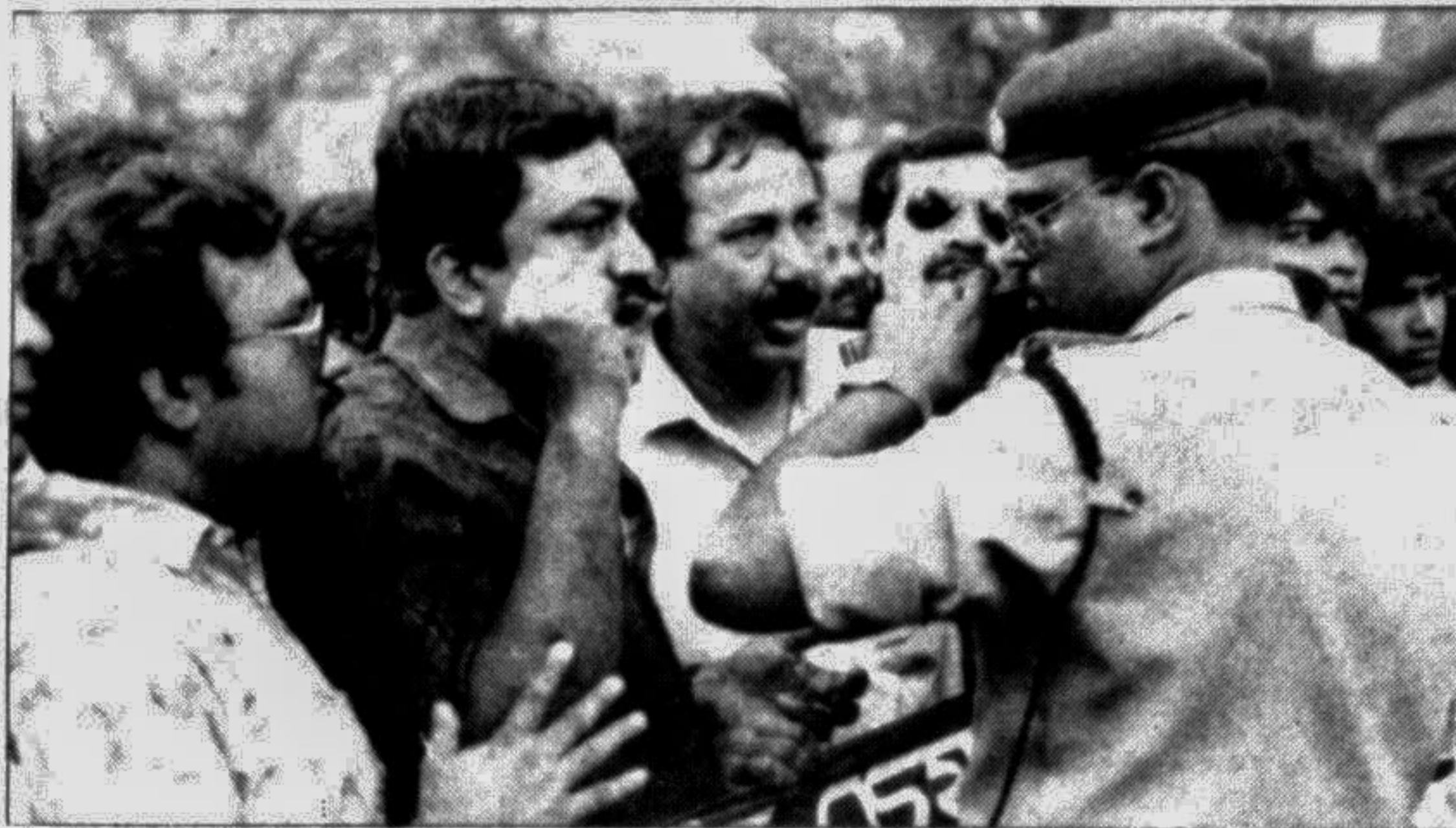
A Jatiya Party procession demanding release of H M Ershad was intercepted by police in the city yesterday.