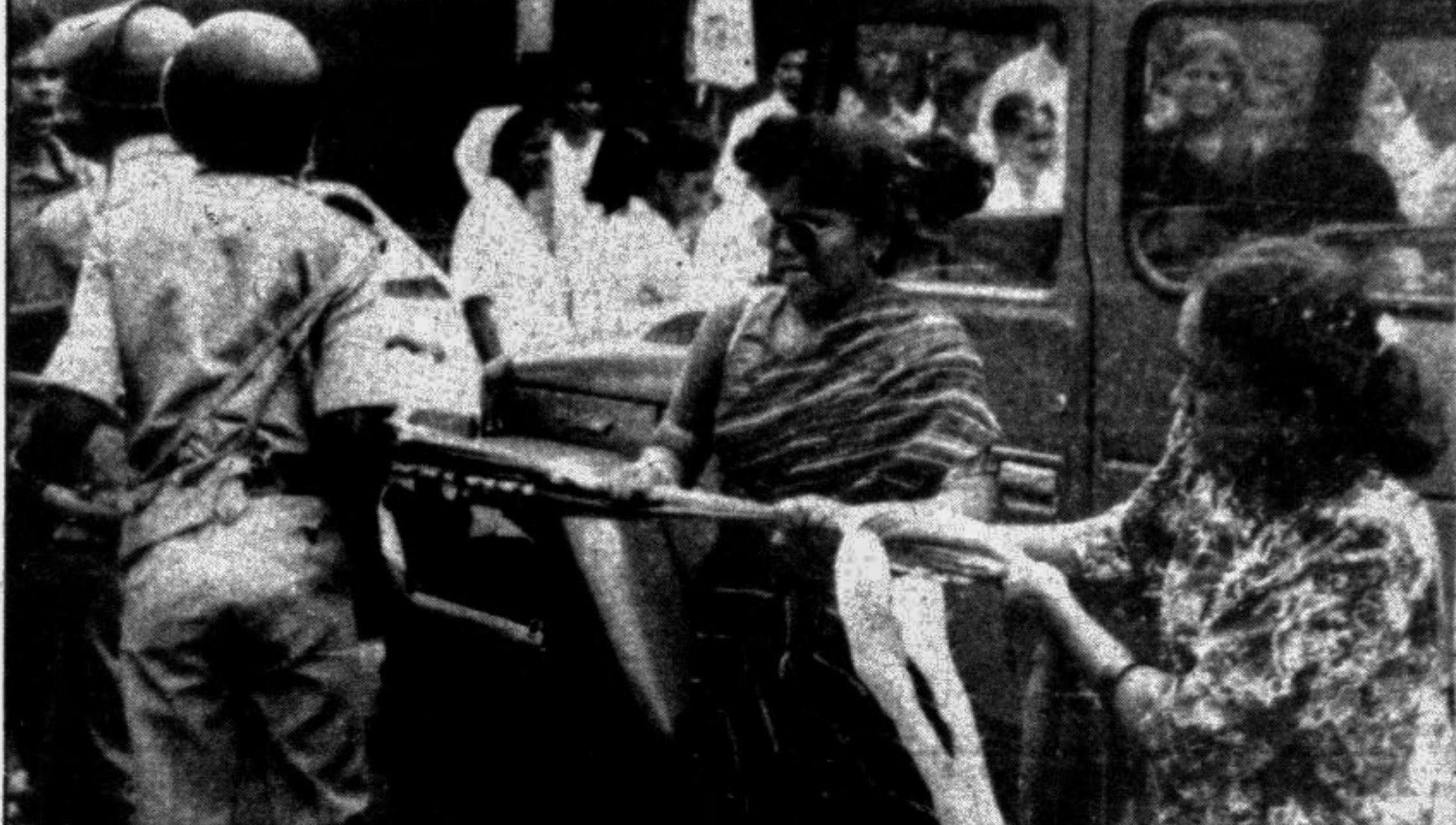
Agitating nurses and police on guard scuffling over the possession of a banner in front of the Bangladesh Secretariat yesterday.