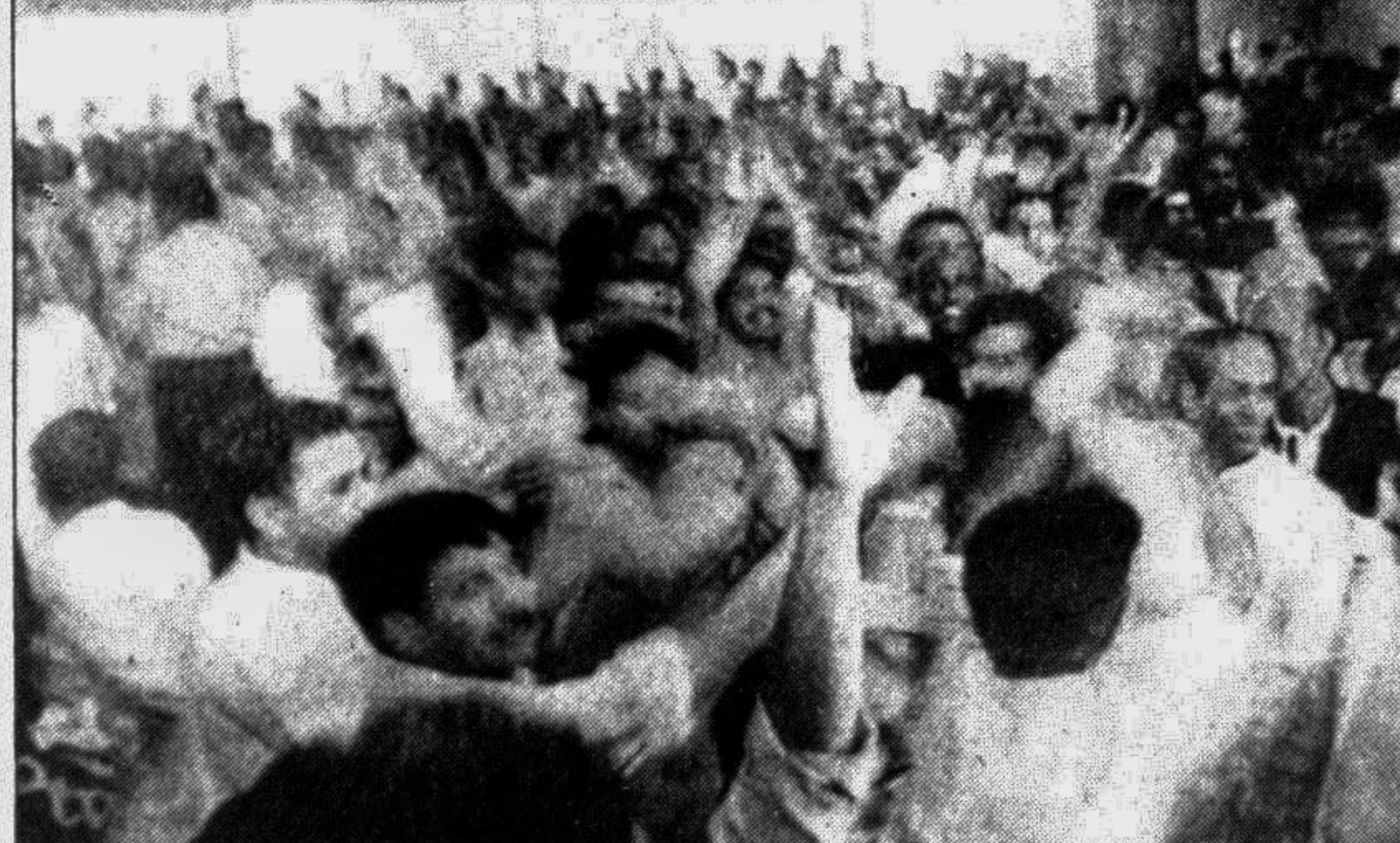
Jubilant supporters of Nawaz Sharif in Islamabad after announcement of the Supreme Court verdict yesterday.