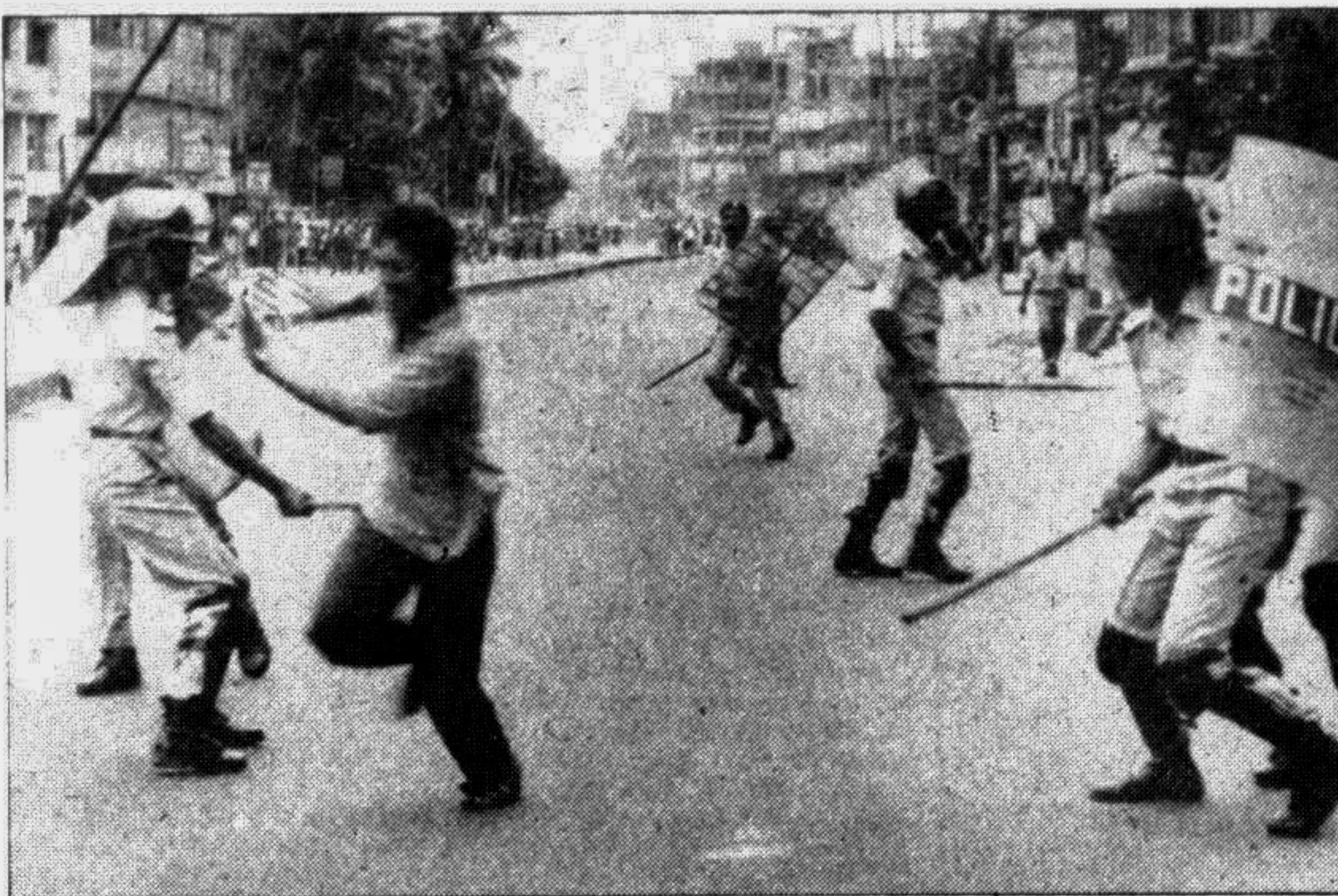
Police baton-charged unruly students who enforced a six-hour hartal in the Siddheswari-Malibagh-Eskaton area of the city yesterday in protest at the killing of a student Monday during a clash with shopkeepers of the Century Arcade.

Among the SAARC nations only Nepal at 152 and Bhutan at 159 rank below Bangladesh in the HDI listing while Sri Lanka tops the ranking at 86. The Maldives is at 112, Pakistan at 132 and India at 134.