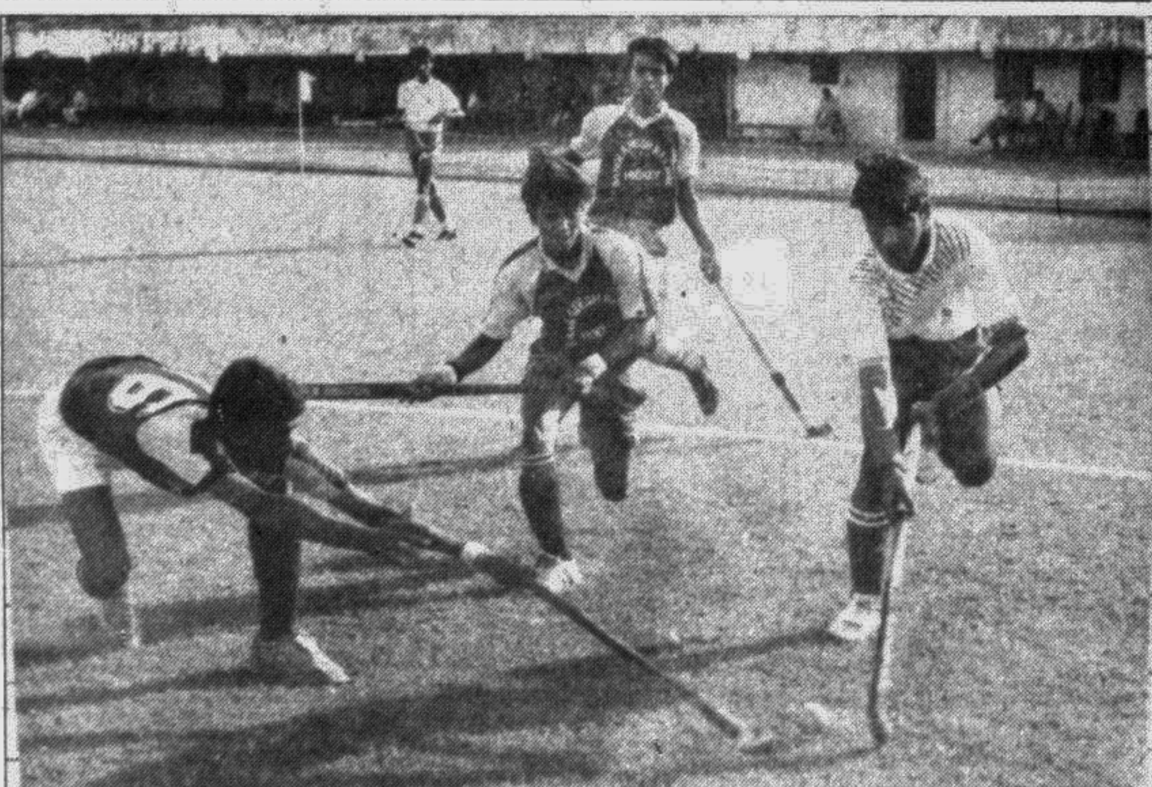
Scene from yesterday's Green Delta First Division hockey league match between Usha Krira Chakra and Bangladesh Railway at the Hockey Stadium. Usha won the match 2-0.