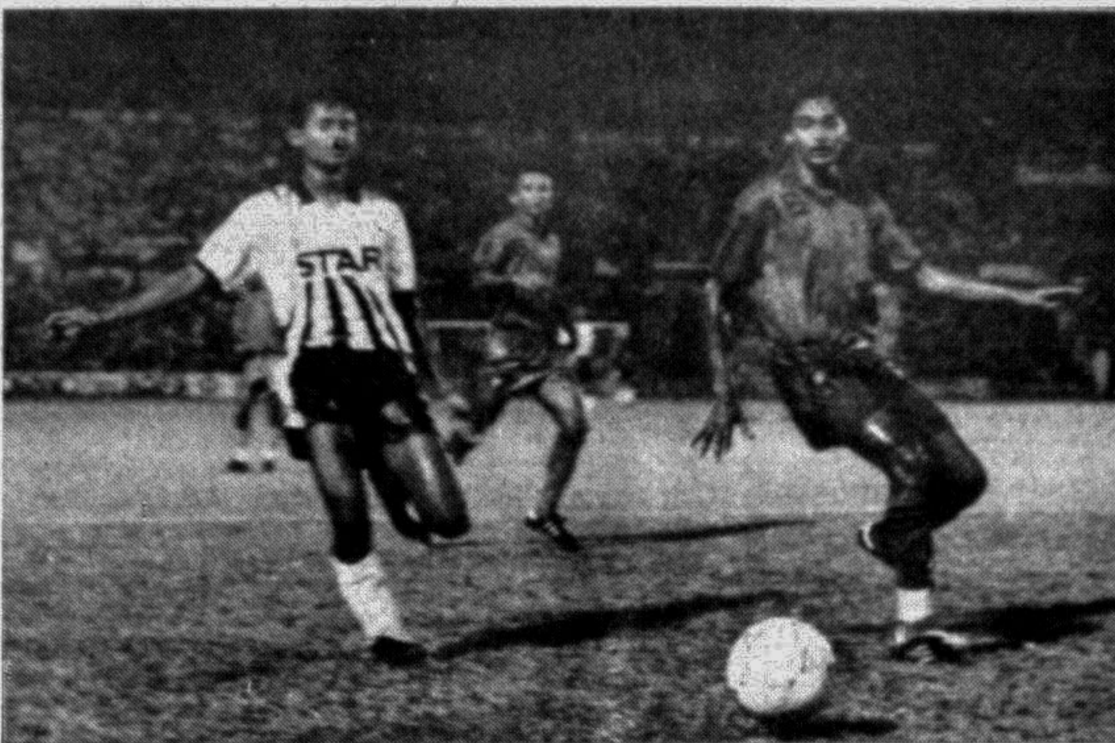
Action from the crucial DMFA Cup round-robin league tie at the Dhaka Stadium yesterday. Mohammedans beat Brothers 2-0 to the Group Two.