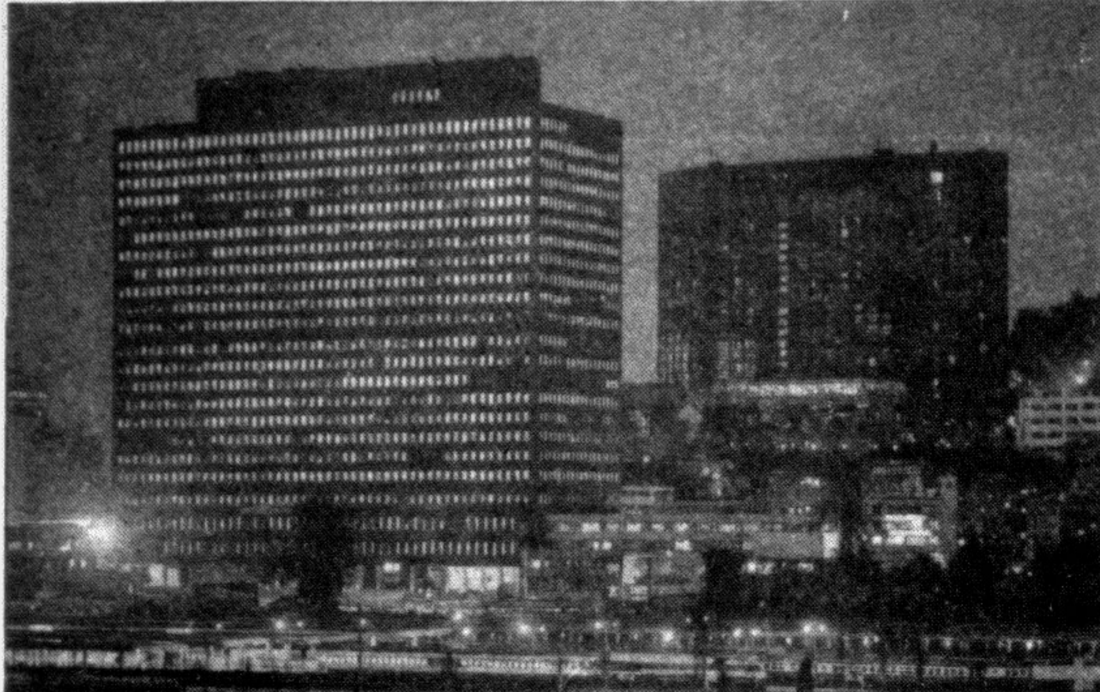
The Daewoo Center in downtown Seoul: Daewoo has built an inner managerial world as strongly based and as sturdy as the edifice itself. We've taken a major turn as a general trader, have reaffirmed our position as a leading contractor, and have successfully implemented group-wide programs for continued growth and progress.

Daewoo Corporation is parent of one of Korea's largest business and industrial groups. With over 70 international branch offices, the corporation deals in over 3,000 products by group companies and non affiliates in trade with more than 120 nations. The corporation is also engaged in natural resources development and construction activities both at home and abroad.