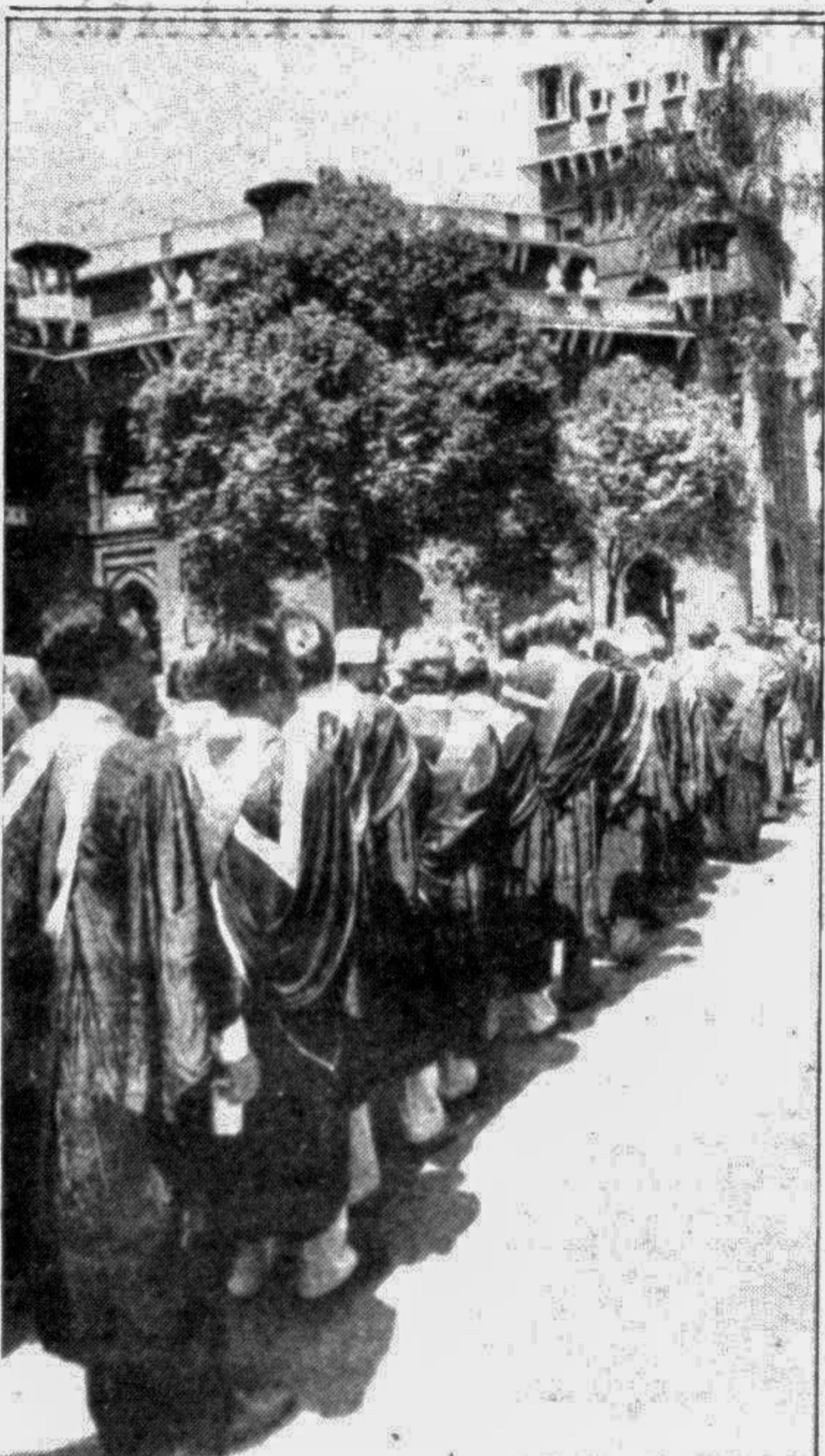
A scene of the Special Convocation at the Curzon Hall premises of the Dhaka University yesterday. (Story on page 1)