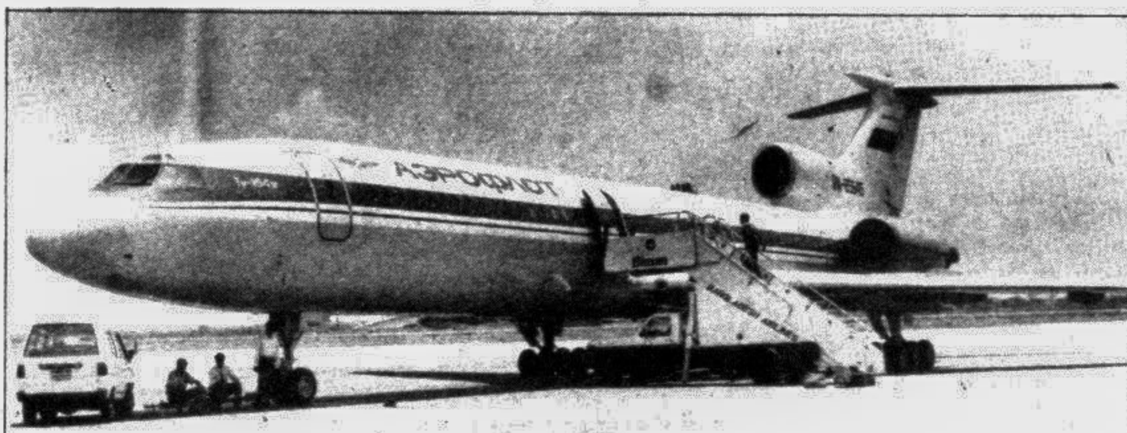
Biman has chartered this Aeroflot aircraft to carry Bangladeshi workers to Malaysia following the damage to one of its DC-10s last Tuesday.