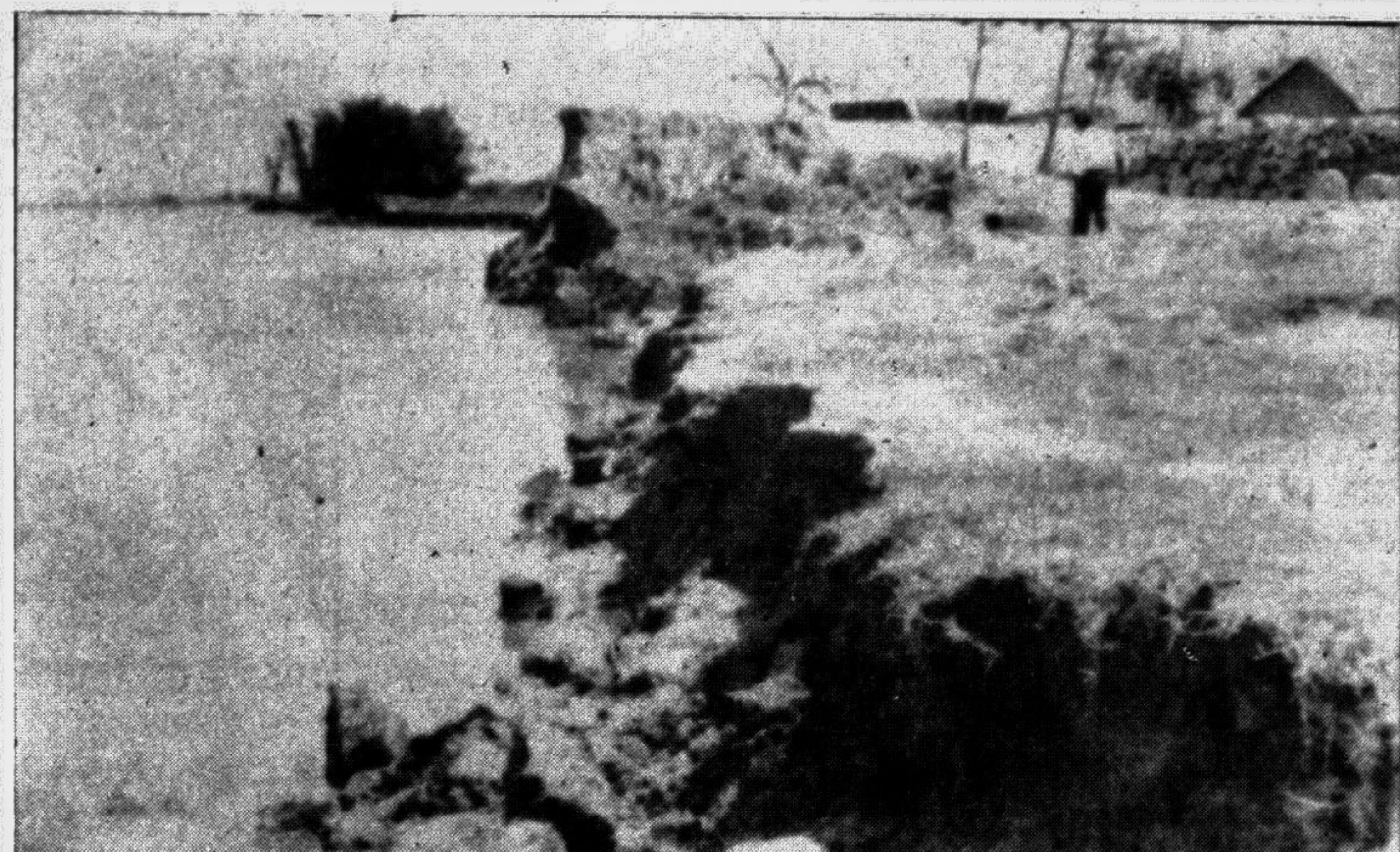
RANGPUR: An advent of the monsoon, the Teesta river erosion at Nohali union under Gangachara thana of the district has rendered hundreds of families homeless.

His body was sent to Sadar hospital for autopsy.