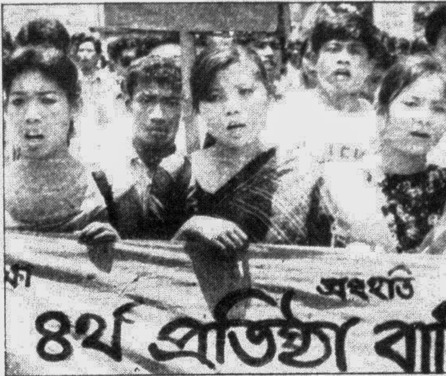
Pahari Chhatra Parishad brought out a procession in the city yesterday in observance of its fourth founding anniversary.

This is a tall order no doubt. They must try to achieve this if they want to see light at the end of the long, dark tunnel.