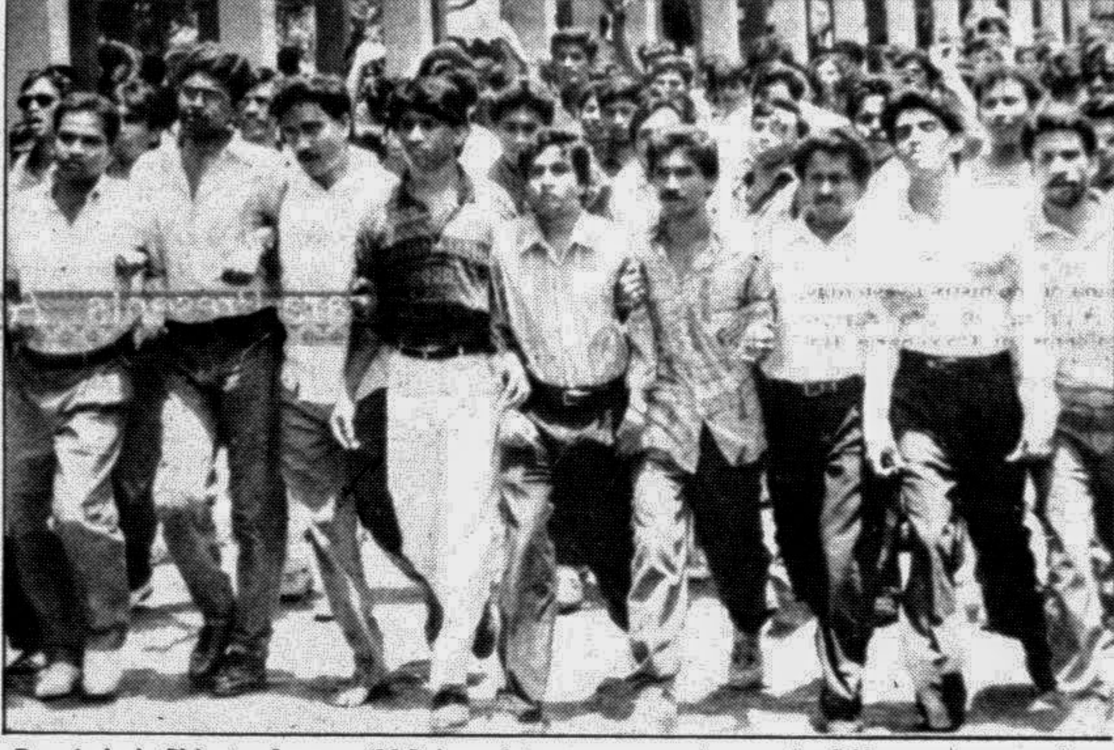
Bangladesh Chhatra League (M-I) brought out a procession on the DU campus yesterday protesting the scheduled visit of Prime Minister Begum Khaleda Zia to the Curzon Hall.