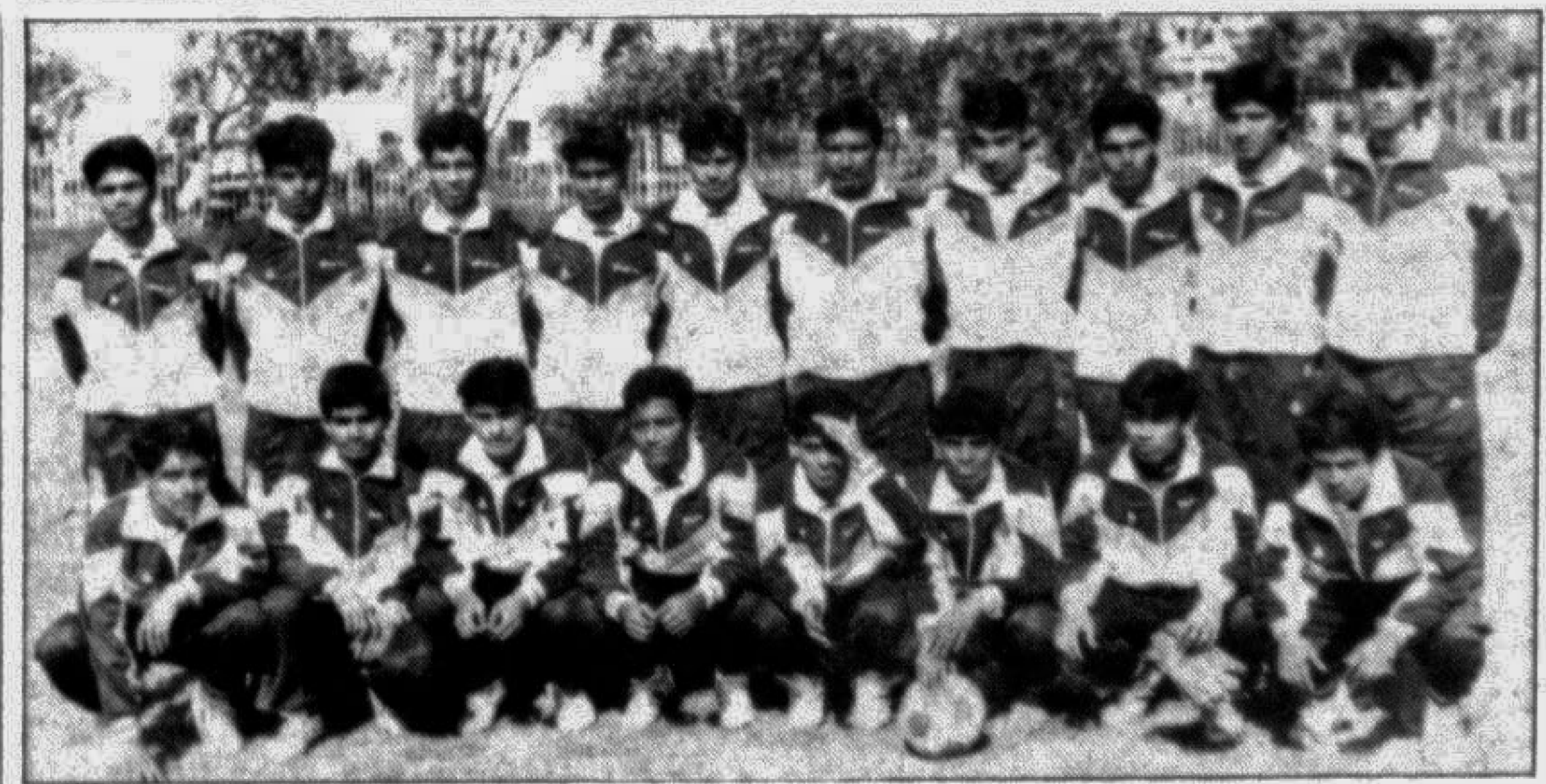
Players of Dipali Jubo Sangha who emerged champions of the Janata Bank Pioneer football league beating Motijheel T & T Club in the final at the Outer Stadium yesterday.