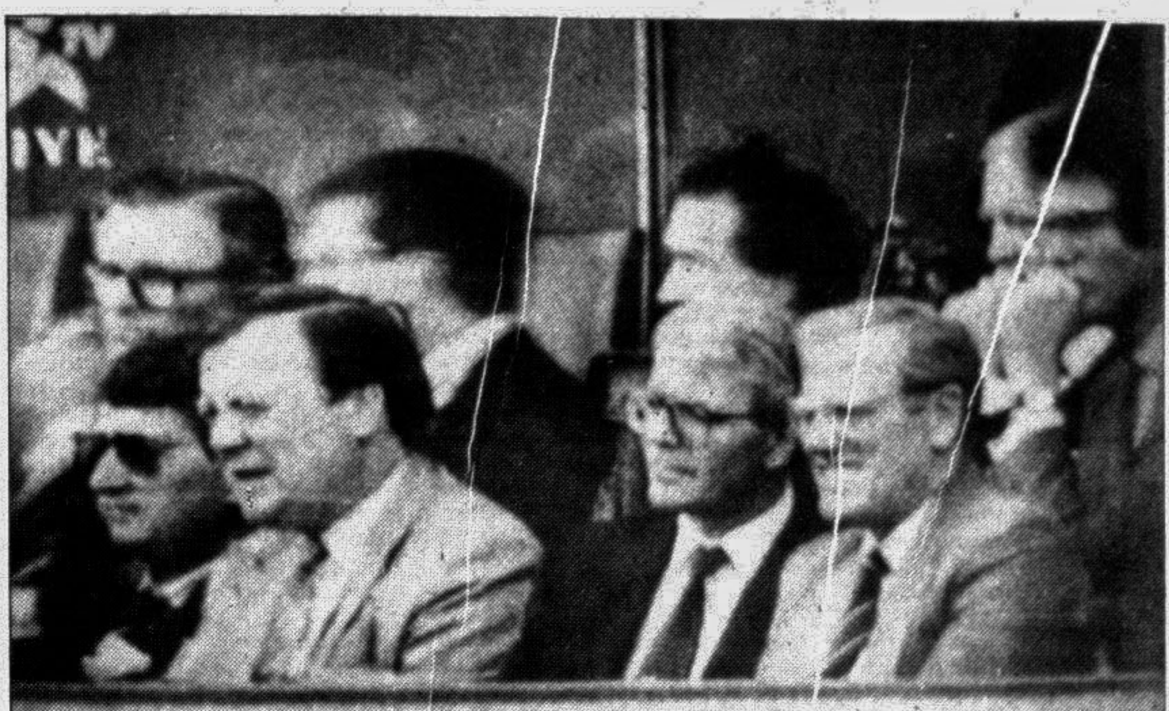
British Prime Minister John Major, an ardent cricket fan, watching closely the proceedings of the second one-dayer between England and Australia at Edgbaston yesterday. Major must have had a wonderful time seeing the England batsmen plundering Aussie attack on their way to making an imposing 277 for five in 55 overs.

State Minister for Youth and Sports Sadek Hossain witnessed the final as chief guest and distributed prizes among the winners.