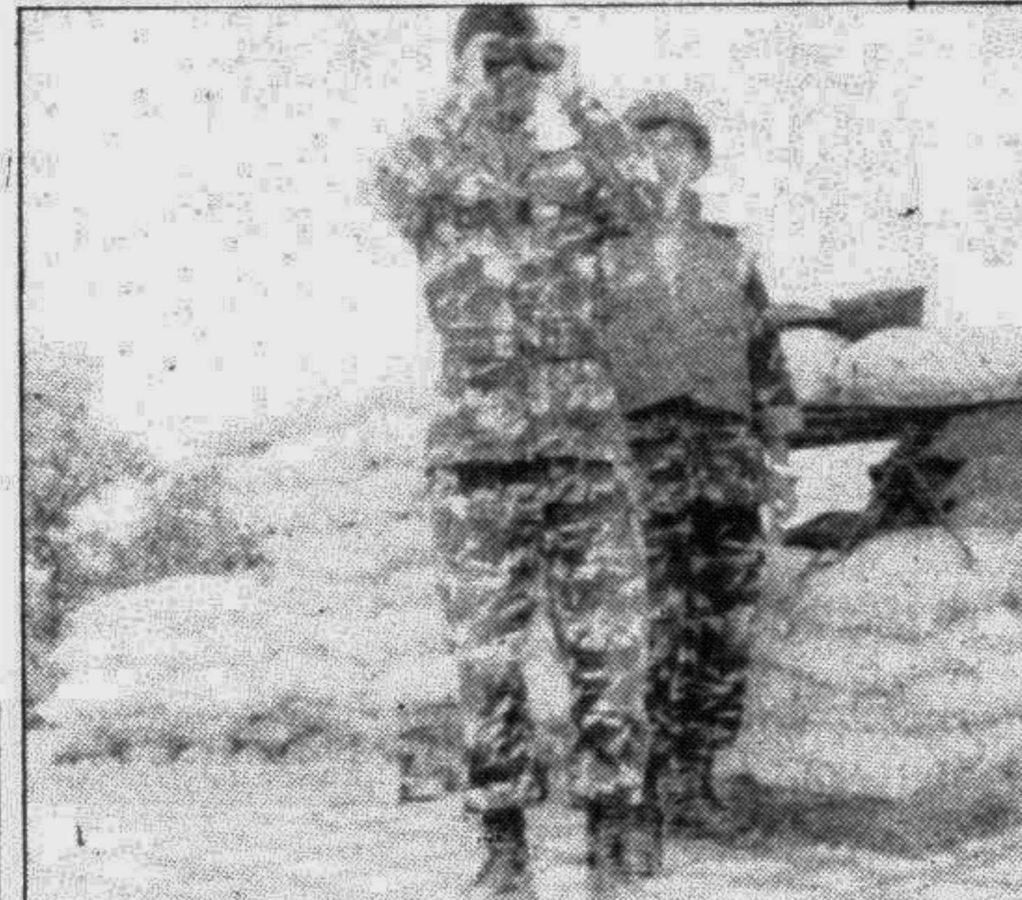
Bangladeshi UN peacekeepers look through binoculars from atop a building at Cambodia's Siem Reap airport May 19, trying to pinpoint the origin of artillery shells coming at the airport. The airport has been shelled four times in five days.