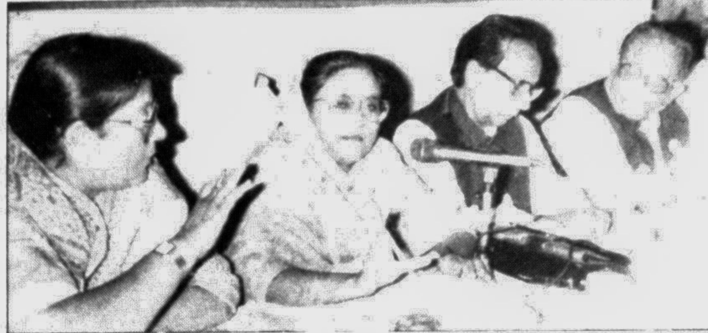
Awami League chief Sheikh Hasina presiding over the extended meeting of the party Central Working Committee at its central office in the city yesterday. Party general secretary Zillur Rahman, Abdus Samad Azad (left) and Sajeda Chowdhury (right) are also seen.

Published by the Editor on behalf of Mediaworld Ltd., 52 Motijheel C/A, Dhaka-1000 and printed by him at The Sangbad Ltd., 36 Purana Paltan, Dhaka. Editorial, News & Commercial Offices : House No. 11, Road No. 3, Dhanmondi R/A, Dhaka-1205. PABX : 500092-4. Advertisement : 500091 (Direct) Fax No. 88-02-863035. GPO Box No. 3257. GRAM : DAILY STAR DHAKA.