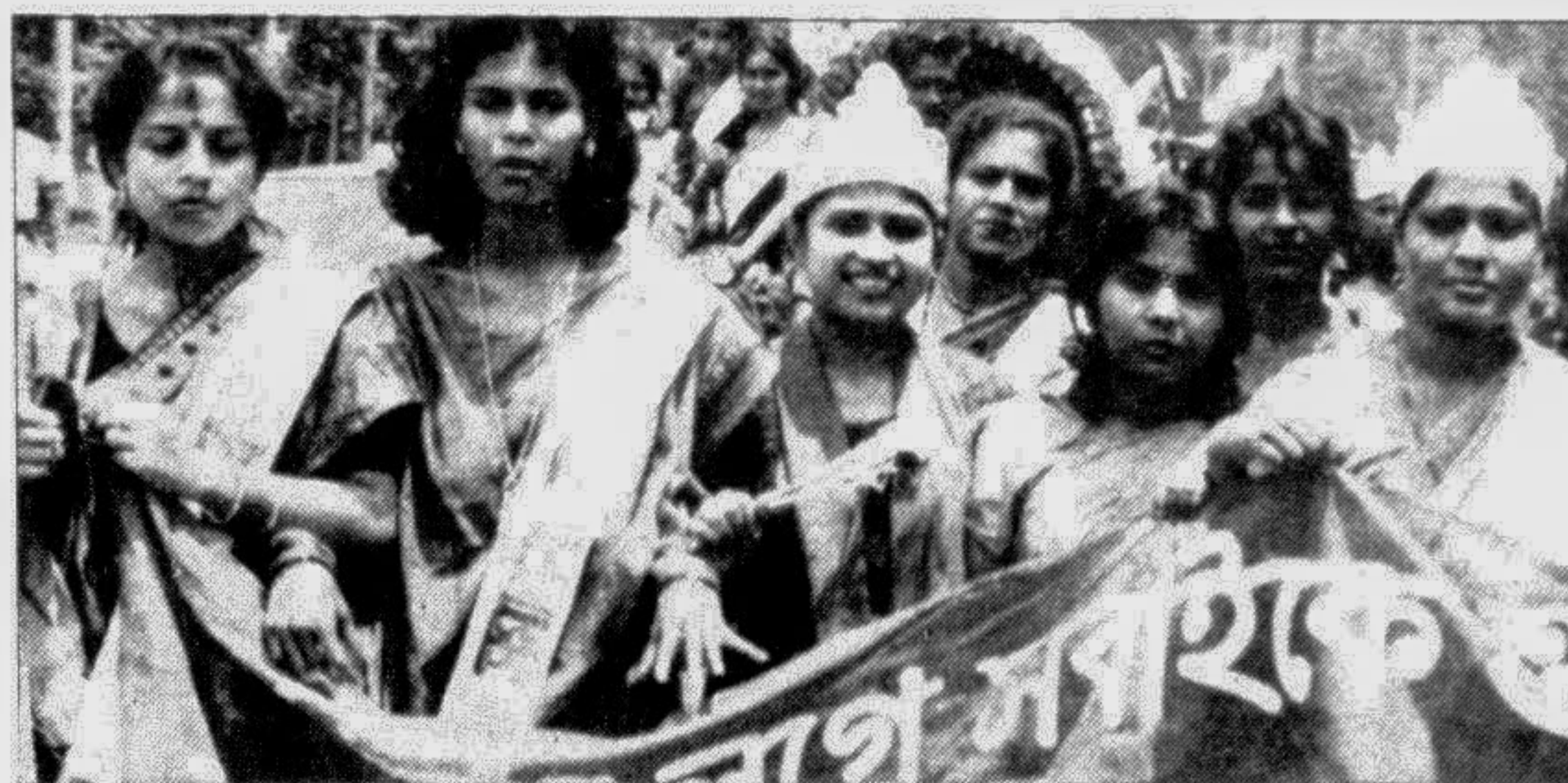
Students of Rokeya Hall brought out a colourful procession on the Dhaka University campus yesterday on completion of their academic session.