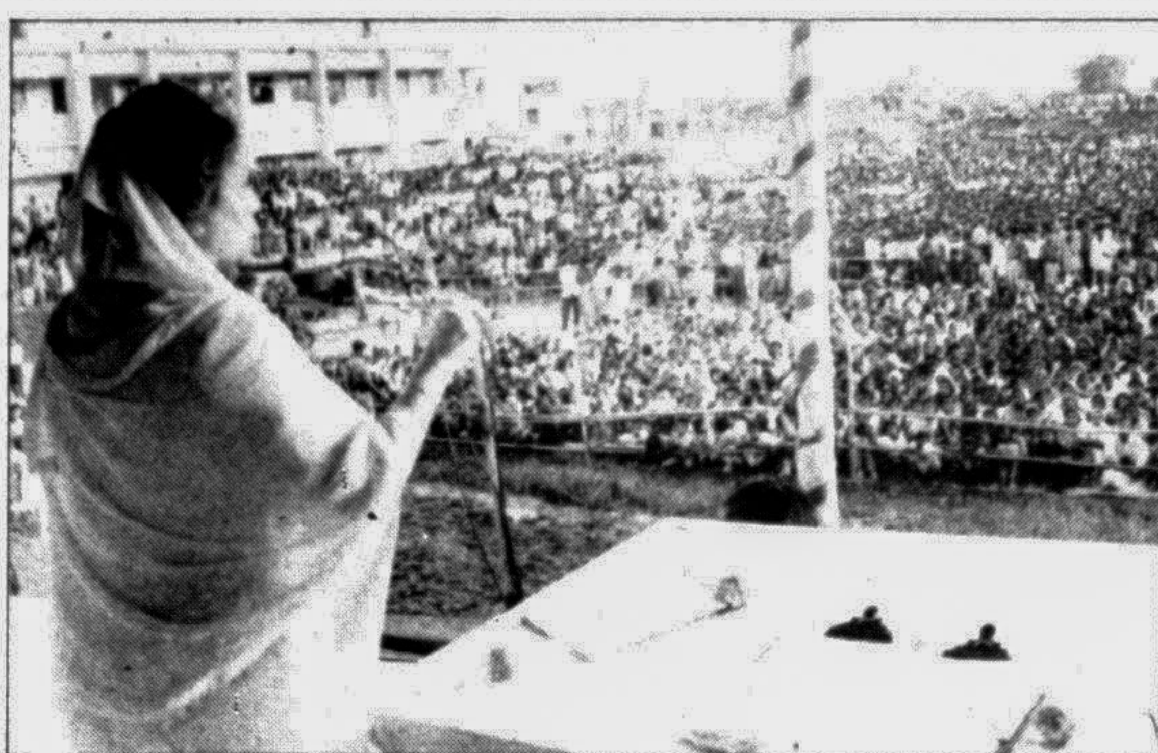
Prime Minister Begum Khaleda Zia addressing a public meeting at Gajaria in Munshiganj yesterday.