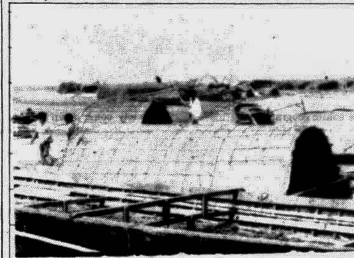
SIRAJGANJ: Shallow-driven country boats are the only transport for reaching Chowhali thana sadar.

Even in this time of technological progress Chowhali thana headquarters stands as an abandoned area. Easy communication and development including power supply may bring prosperity to the Chowhali thana sadar at Khaskanlia.