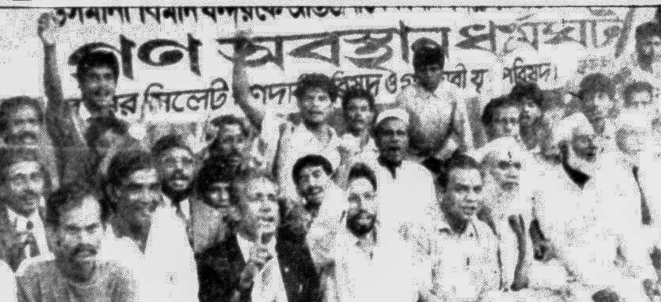
People of Sylhet district residing in Dhaka staged a sit-in demonstration in front of the National Press Club yesterday demanding creation of Sylhet division.