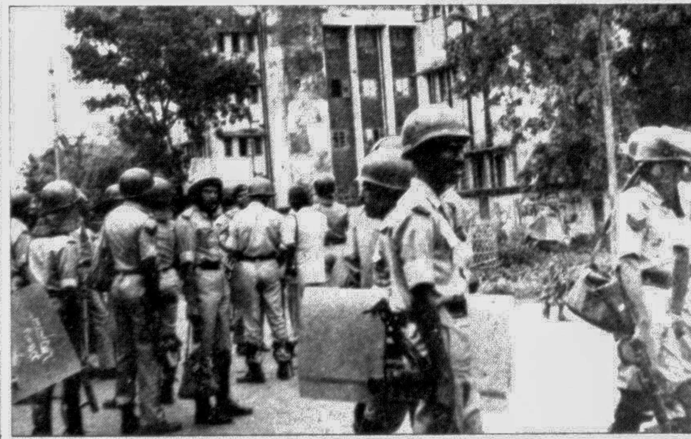
Police raided the Latif Hostel of Tejgaon Polytechnic Institute yesterday.

Foreign Minister ASM Mostafizur Rahman called on Amir of Kuwait Sheikh Jaber Al-Ahmed Al-Sabah and handed to him a message from Prime Minister Begum Khaleda Zia on Monday, reports UNB. The Foreign Minister also met Kuwaiti Prime Minister Sheikh Saad Al-Abdullah Al-Salam Al-Sabah, Defence Minister Sheikh Ali Salem Al-Sabah and Interior Minister Sheikh Ahmad Al-Hamoud Al-Jaber, according to a message received in Dhaka yesterday. He also held official talks with the Deputy Prime Minister in charge of the Foreign Ministry on ways of enhancing bilateral cooperation. During the talks, Mostafiz reiterated Bangladesh's continued support for the implementation of all UN resolutions in support of the cause of Kuwait, particularly the demand of release of all Kuwaiti prisoners of war still held in Iraq.