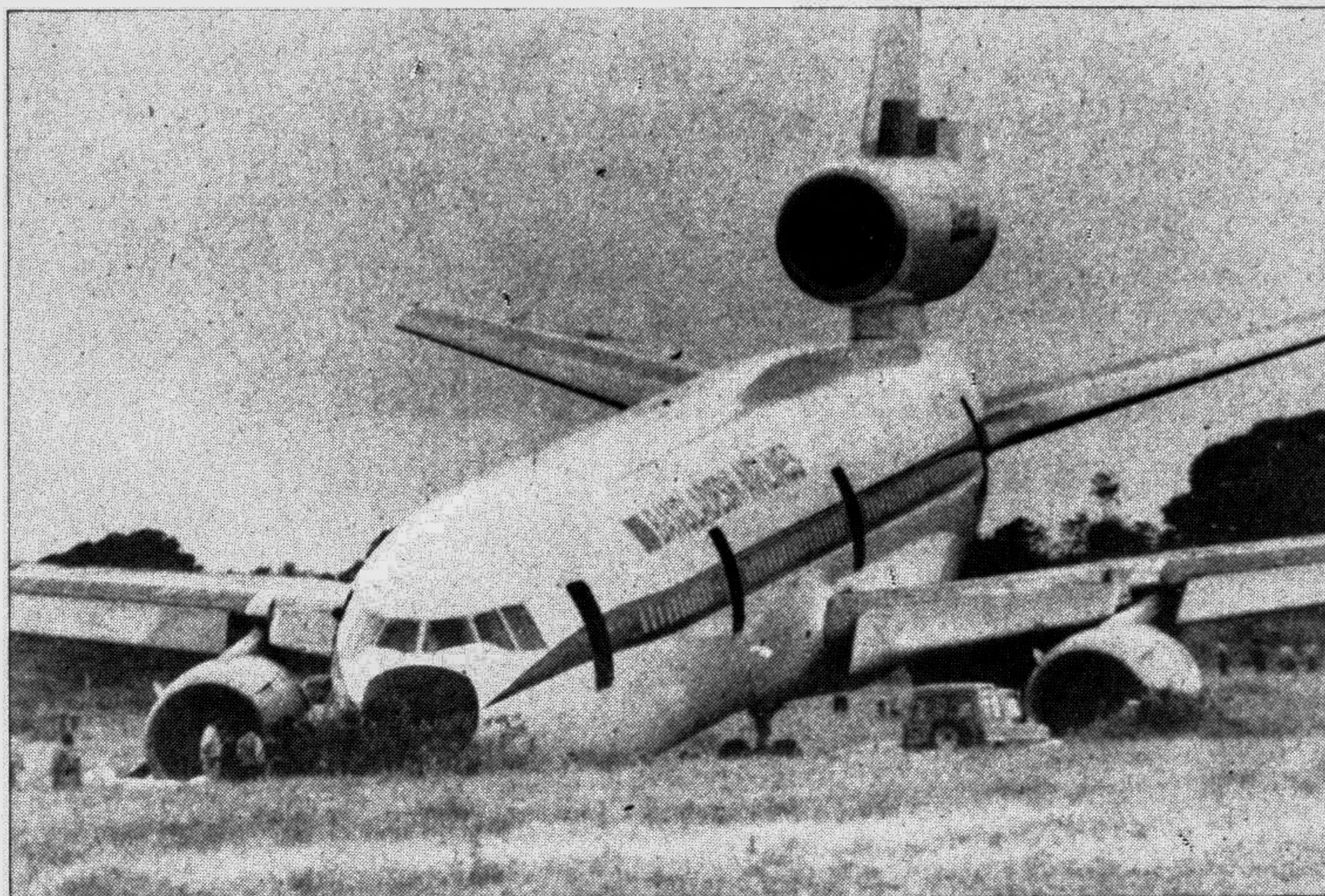
A Biman DC-10 arriving from Jeddah with 135 on board overshot the runway while attempting to land in heavy rain early yesterday morning. The aircraft skidded and came to a grinding halt almost a kilometre past the runway but miraculously no one was hurt. The nose wheel of the jet fell off.

A partial eclipse of the sun will take place on May 21. It will begin at 6-18 minute 48 second pm and will end at 10-19 minute 30 second pm on May 21. The magnitude of the eclipse will be 0.736 and the highest magnitude of the eclipse will occur at 8-19 minute 18 second pm. This will not be visible anywhere in Bangladesh, reports BSS.