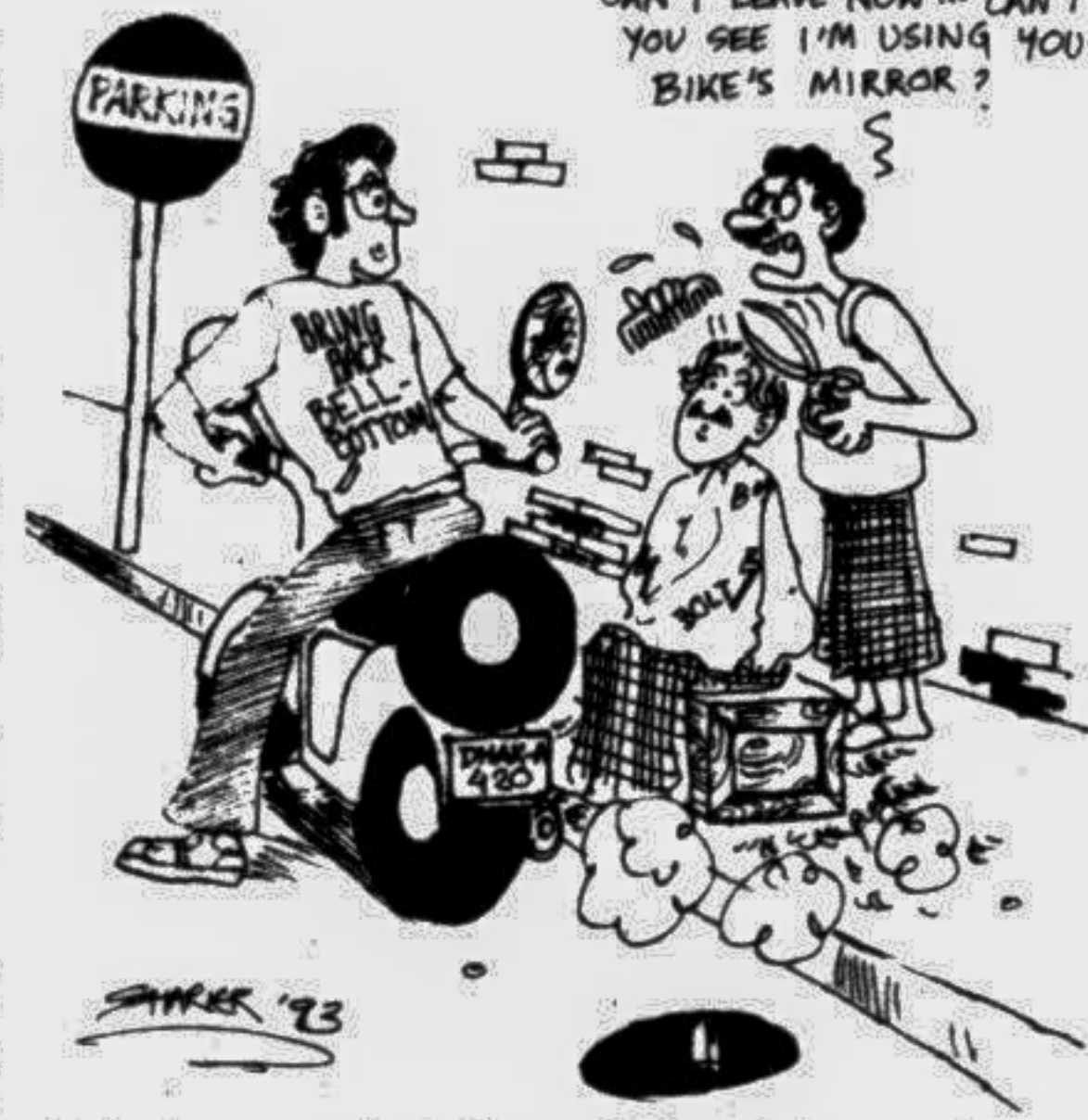
WAITA MINUTE!! YOU CAN'T LEAVE NOW... CAN'T YOU SEE I'M USING YOUR BIKE'S MIRROR?

But if we look at it in its entirety, the pavement 'hairdresser' has a uniqueness all his own, and is so much apart of Dhaka and its surroundings that should they suddenly decide to pack up and leave one fine morning, the Dhakaite would be devastated. And his hair and beard would be dishevelled beyond recognition.