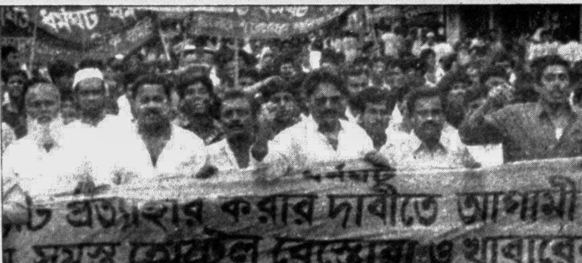
Bangladesh Restaurant Owners' Association brought out a procession in the city yesterday demanding withdrawal of VAT.

103, AGRABAD COMMERCIAL AREA, CHITTAGONG AS AGENTS: MITSUI O.S.K. LINES LTD. TOKYO PHONES: 503317, 500686.88