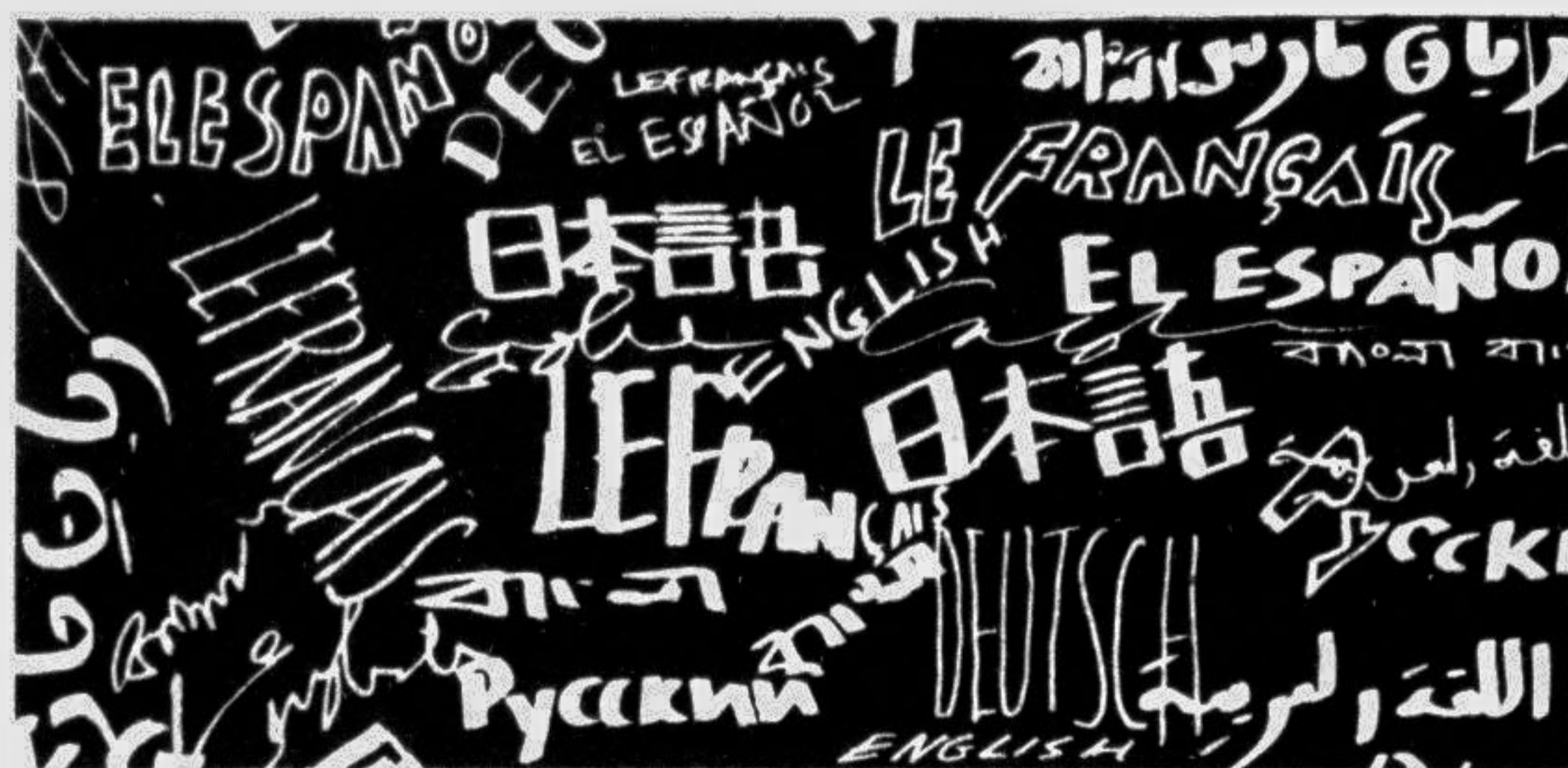
Languages in myriad forms

The Institute of Modern Languages (IML) of the University of Dhaka can really be called a world of its own. True, there are some other language-teaching institutes in Dhaka, like the British Council, the Goethe Institut or the Alliance Francaise, but none of those teaches more than one language while IML can boast of offering courses in as many as 11 languages.