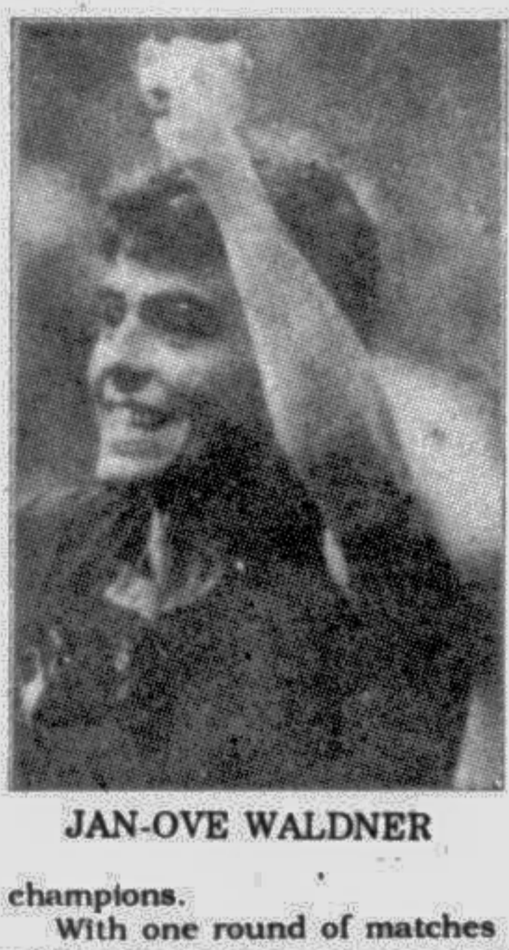
JAN-OVE WALDNER champions. With one round of matches remaining, Sweden now go through to the knockout stages with Germany and North Korea as the top three teams from Group B.