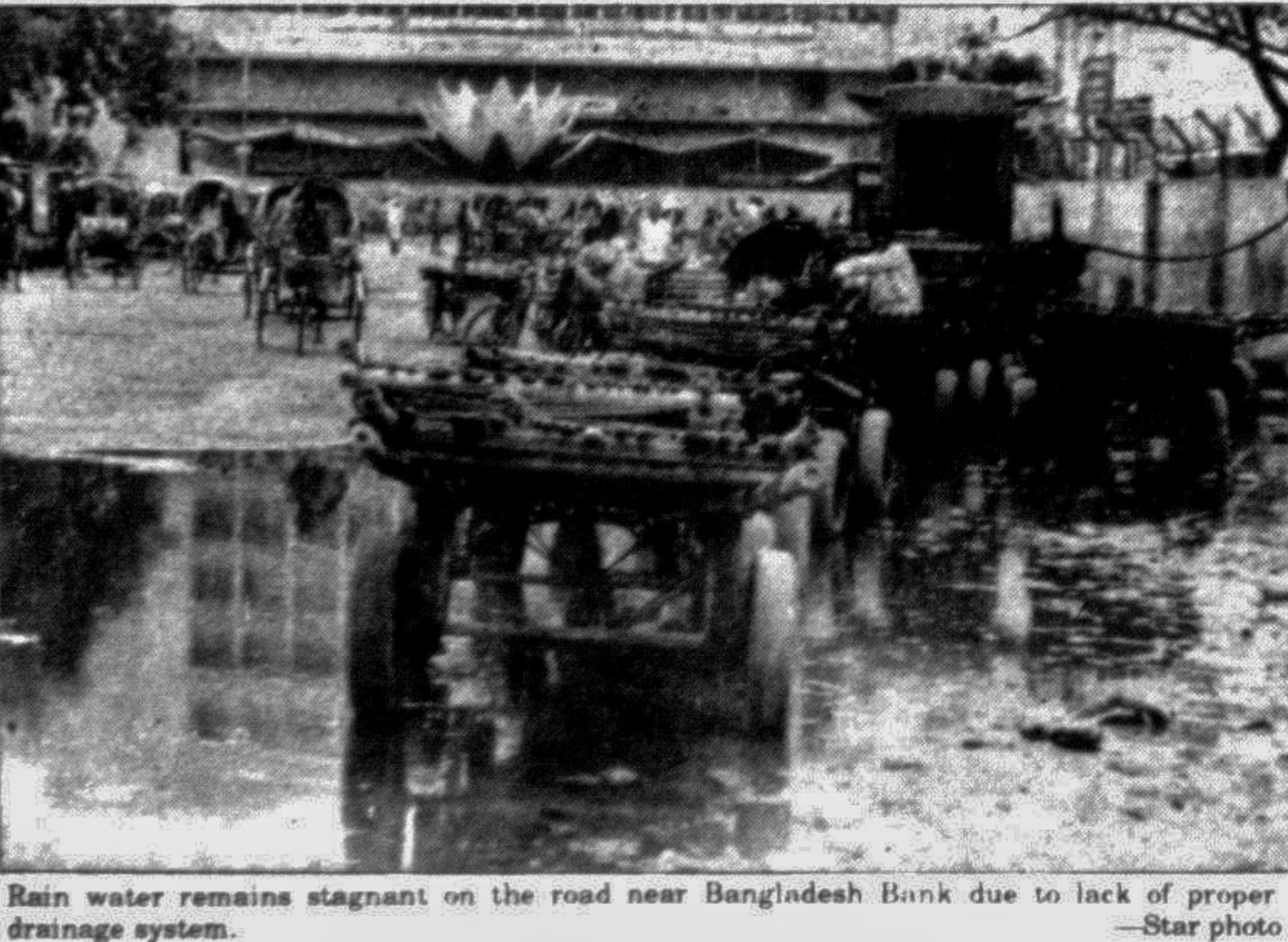
Rain water remains stagnant on the road near Bangladesh Bank due to lack of proper drainage system.