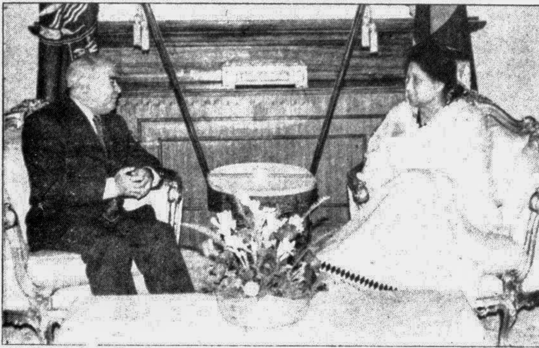
Turkish Ambassador Ahmet Ermisoglu made a farewell call on Prime Minister Begum Khaleda Zia at her office yesterday.