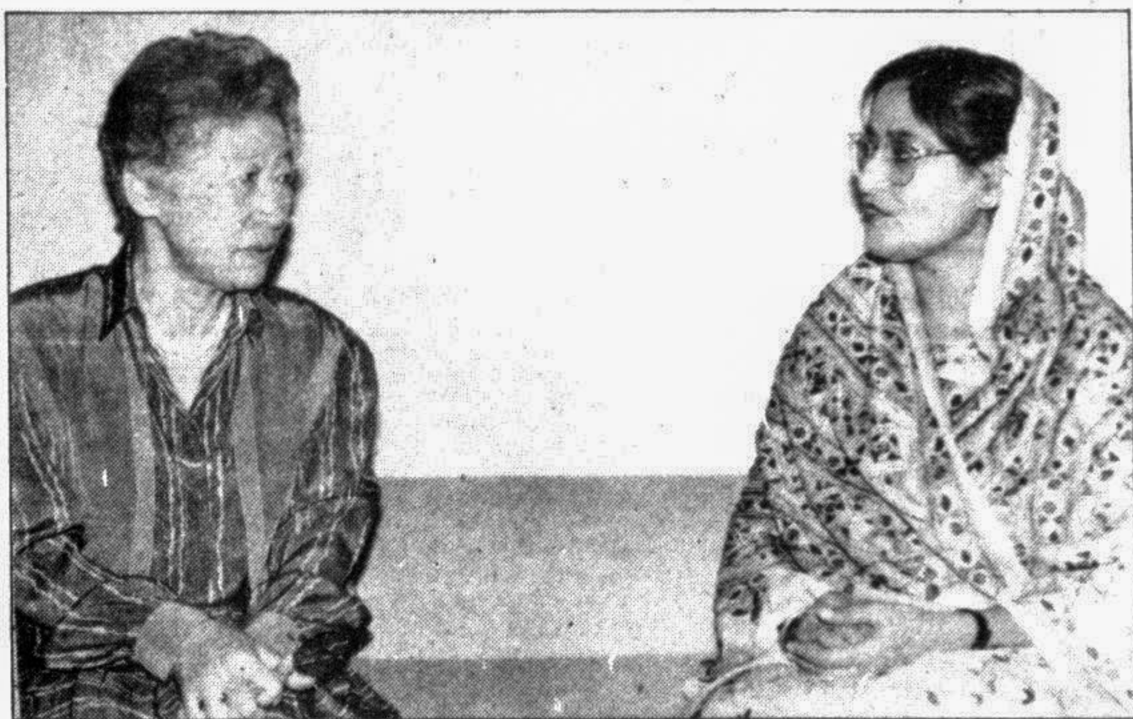
AL chief and Leader of the Opposition in Parliament Sheikh Hasina called on Dr Sadako Ogata, the United Nations High Commissioner for Refugees at Hotel Sheraton yesterday.