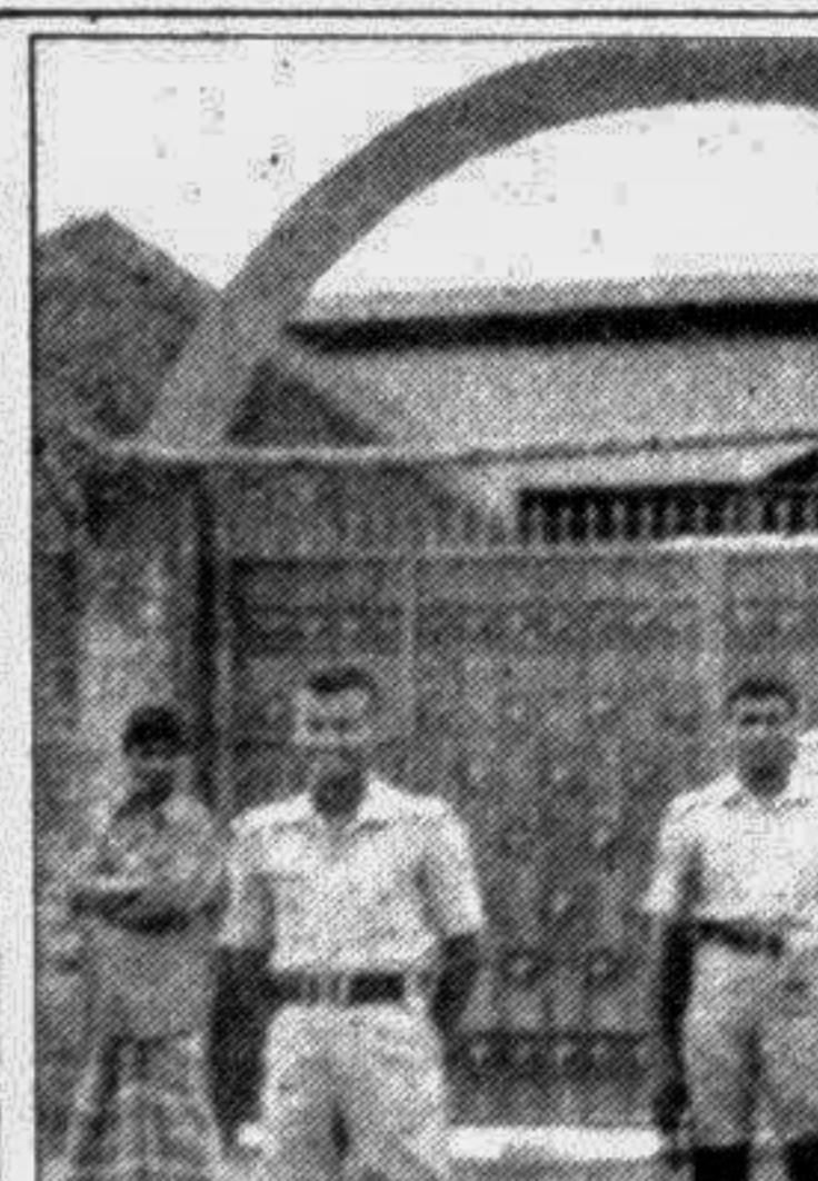
Police guarding the Chand Textile Mills in Shyampur near the capital on the first day of the 72-hour SKOP shutdown yesterday.

Suharto tells NAM meet New partnership to rid world of econ disarray