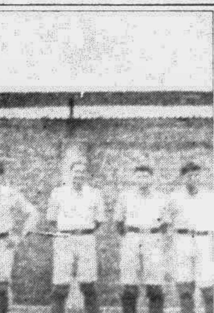
Police guarding the Chand Textile Mills in Shyampur near the capital on the first day of the 72-hour SKOP shutdown yesterday.

MOSCOW, May 11: President Boris Yeltsin forged ahead with a government shakeup Tuesday by dismissing the chief of his powerful Security Council, part of the effort to give more authority to radical reforms, reports AP.