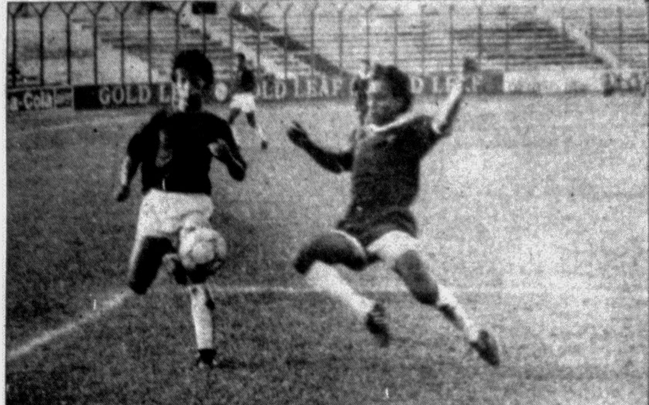
Action from yesterday's DMFA Cup football tournament match between Sadharan Bima Krira Sangstha and Badda Jagarani Sangsad at the Dhaka Stadium. Sadharan Bima beat Badda Jagarani 2-1.