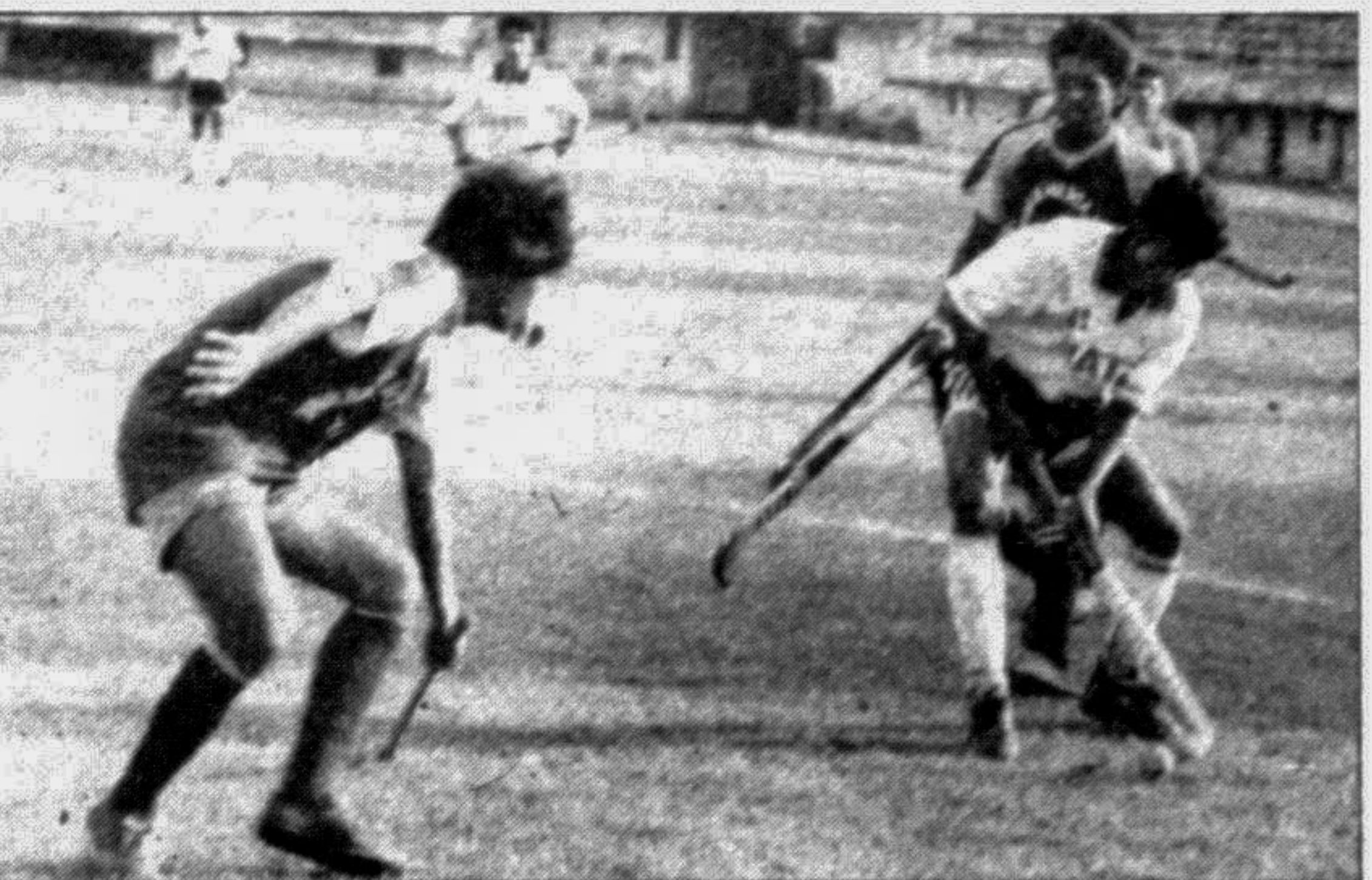
Action from yesterday's Metropolitan Green Delta First division hockey league match between Mohammedan Sporting Club and Bangladesh Railway at the Hockey Stadium. Mohammedans trounced Bangladesh Railway 4-0.

ATLANTA, May 11: Former world heavyweight boxing champion Evander Holyfield said on Monday he plans to reclaim the title he lost last year to Riddick Bowe and reign at least until after the 1996 Olympics in his home town of Atlanta, reports Reuter.