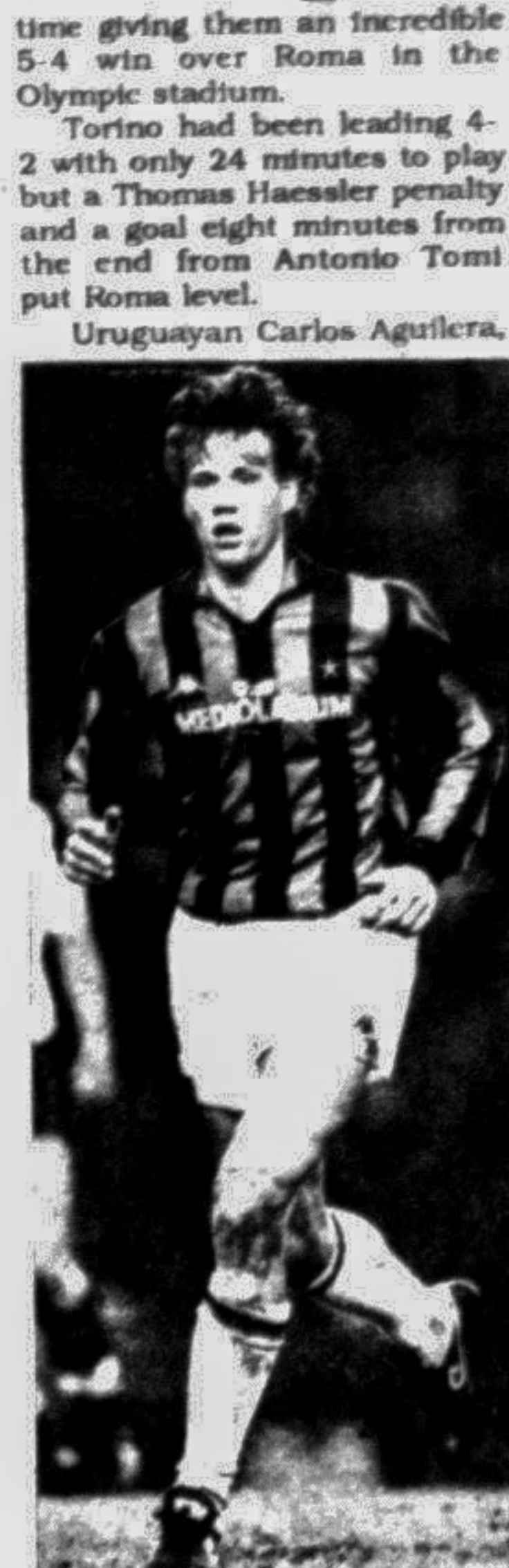
MARCO VAN BASTEN

ROME, May 10: Marco van Basten, starting his first match since December 13, secured an AC Milan goal back to winning ways against Ancona and virtually assured they would retain their Italian league title on Sunday, reports AFP.