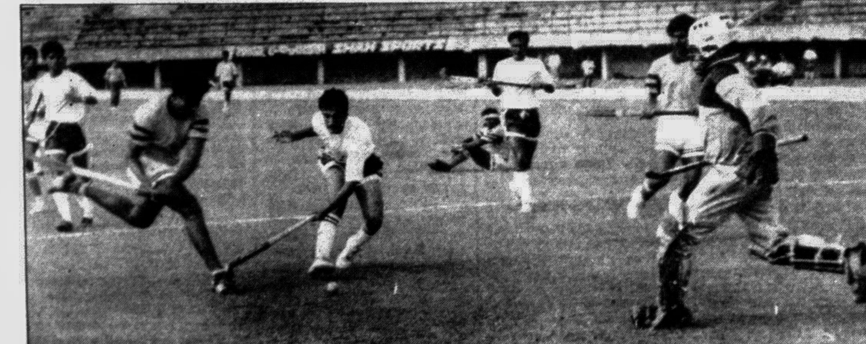
Action from yesterday's Green Delta First Division hockey league match between Sadharan Bima Krira Sangstha and Bangladesh Sporting Club at the Hockey Stadium. Sadharan Bima won the match 5-1.