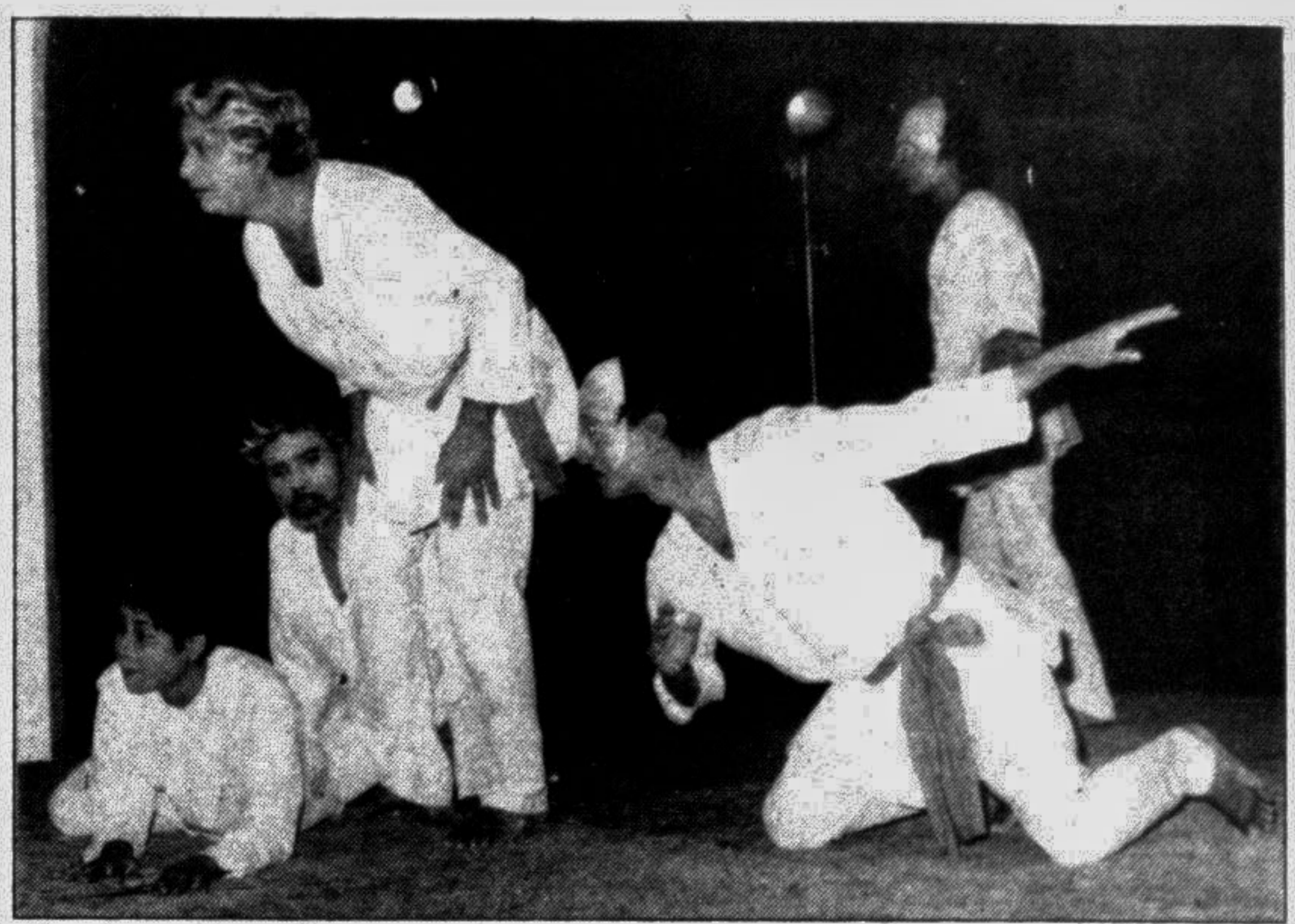
Sangbarta Group Theatre of Calcutta staged Rabindranath Tagore's 'Dakghar' at the German Cultural Centre in the city yesterday.