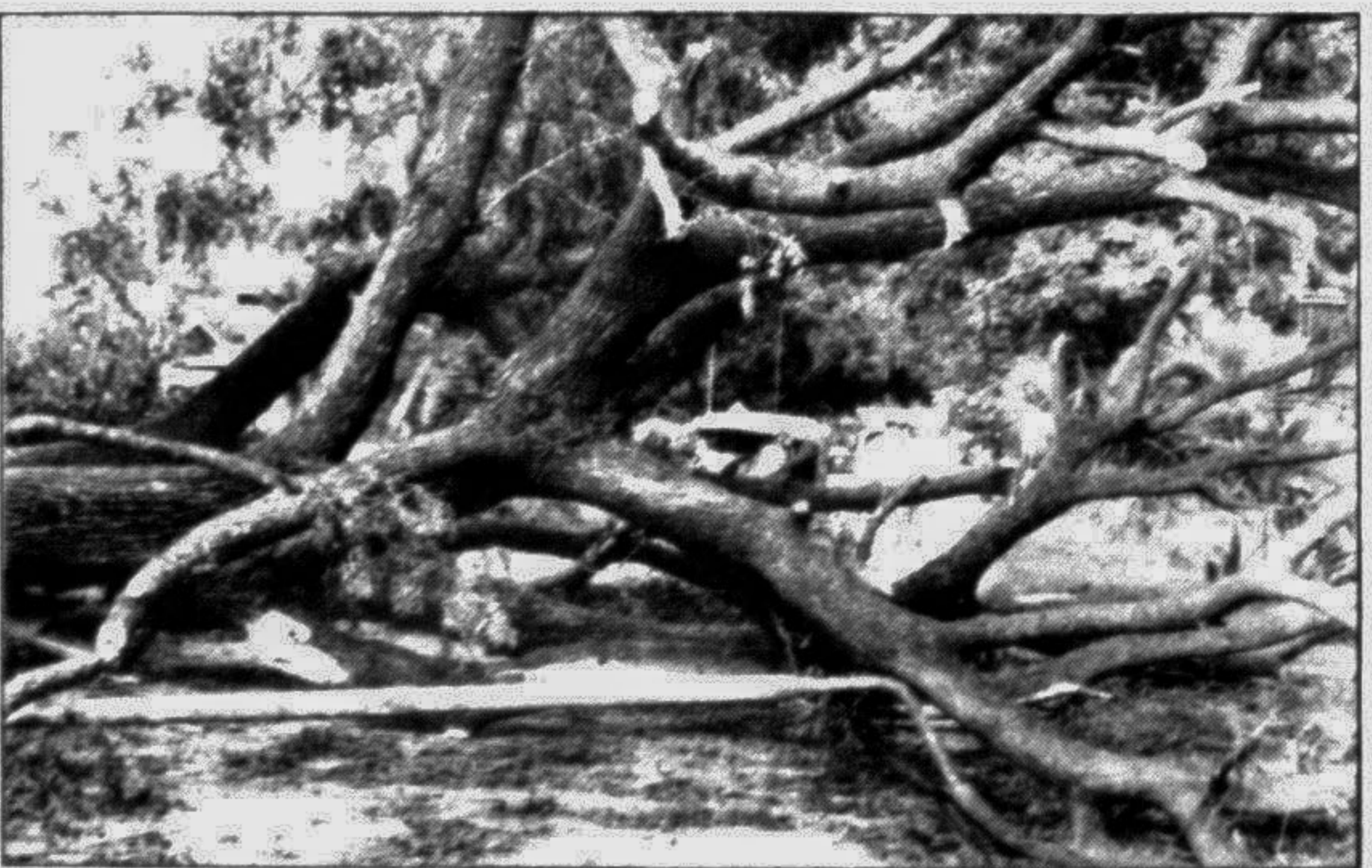
The tree in front of Madhu's Canteen of Dhaka University was uprooted during the storm on Sunday night.

He said that the government had already taken examination for the appointment of the teachers in the vacant post. The answer scripts of the examinees were under process. After completion of the process viva examination would be taken for appointment, he said.