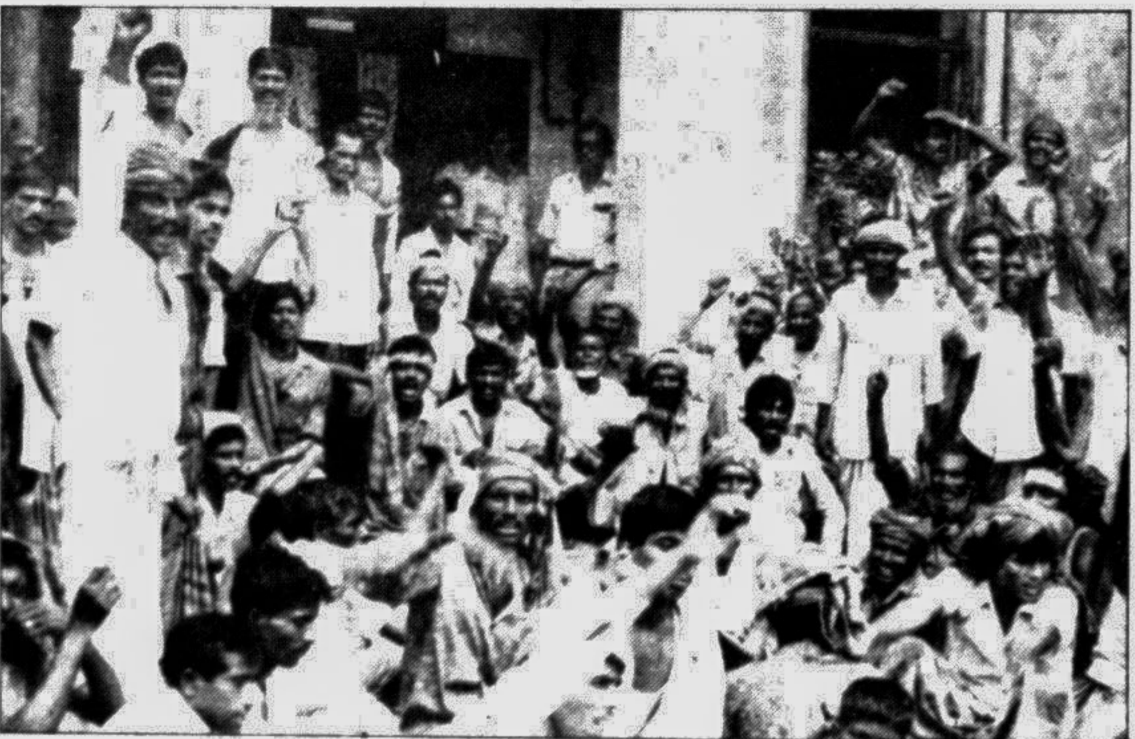
Workers of CSD godown at Teigaon in the city staged a demonstration yesterday demanding immediate payment of their 15 months' arrears.

An eleven-member Nepalese team of senior officials, now on a week-long study tour here visited the Ministry of Land yesterday, reports BSS.