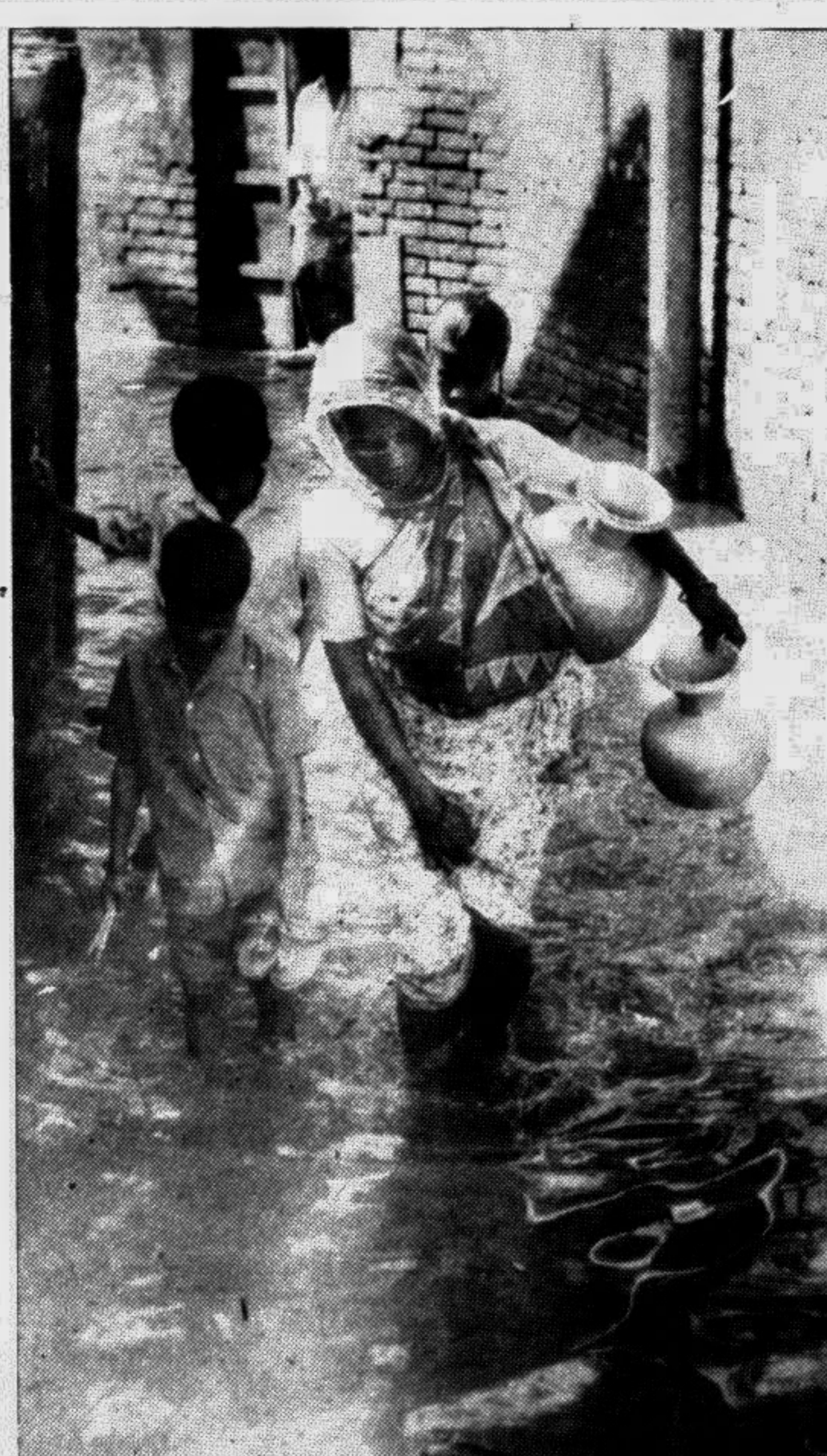
Stagnant water caused by Sunday's heavy downpour left the residents of Bahadurpur Lane, Faridabad in the city in a miserable condition.