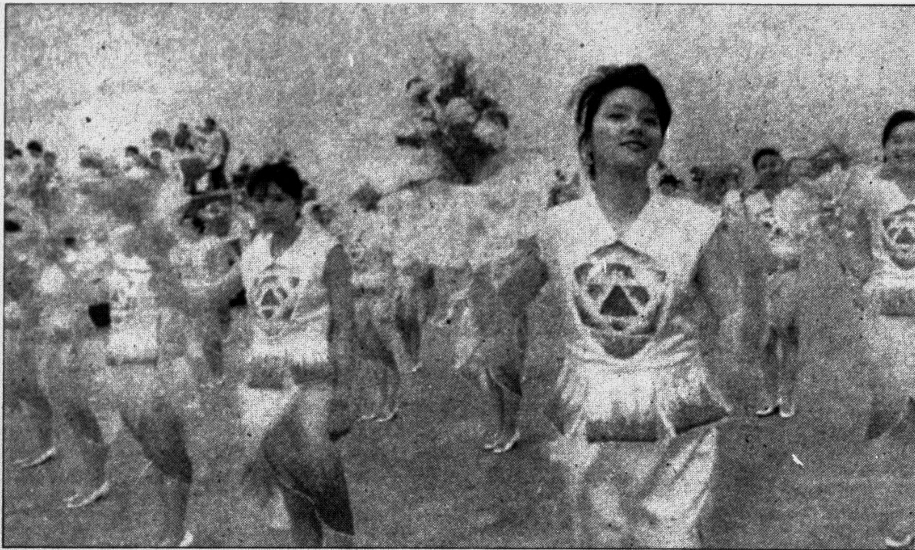
Around 11 Shanghai college students perform a welcoming dance at the Shanghai Airport following the arrival of International Olympic Committee (IOC) president Juan Antonio Samaranch yesterday. Samaranch is in China to attend the opening ceremony of the first East Asian Games.