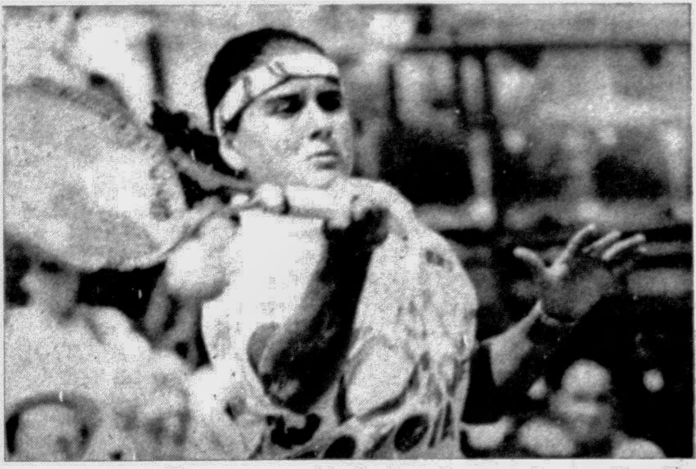
Spaniard Conchita Martinez makes of forehand smash against American Mary Joe Fernandez during their Italian Open semifinal in Rome on May 8. Martinez made it to the final with a 7-5, 6-4 victory. Martinez faces Argentine Gabriela Sabatini, who beat another Spaniard Arantxa Sanchez in the final.