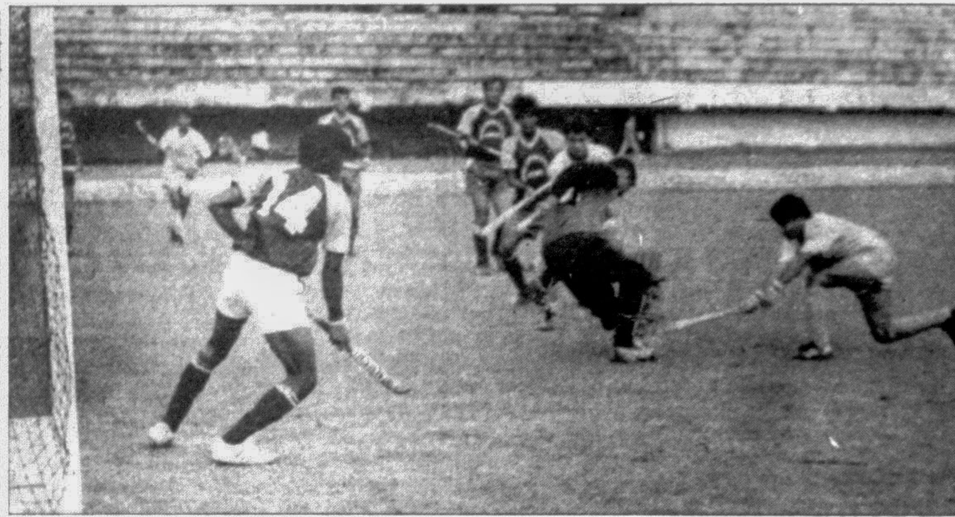
Action from yesterday's Metropolis Green Delta First Division hockey league match between Abahani Krira Chakra and Bangladesh Railway at the Hockey Stadium. Abahani posted a massive 8-0 victory over their lowly opponents.

Dhaka Mariner Youngs Club take on Bakshibazar Club while Victoria Sporting Club meet Mitford Friends Club today.