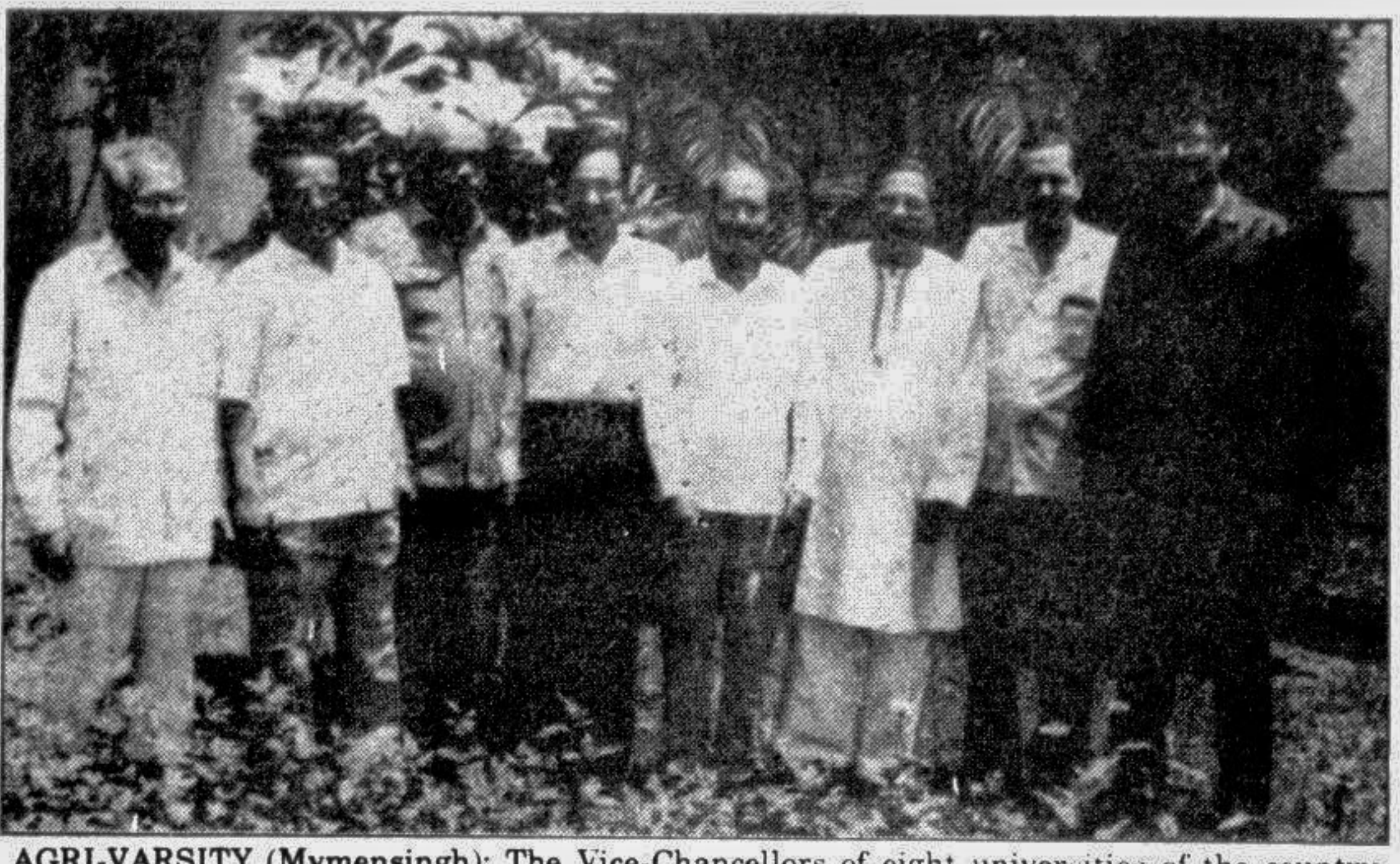
AGRI-VARSITY (Mymensingh): The Vice-Chancellors of eight universities of the country pose for a photograph just before the meeting of the VC's Standing Committee held at the guest room of Bangladesh Agricultural University (BAU) recently.