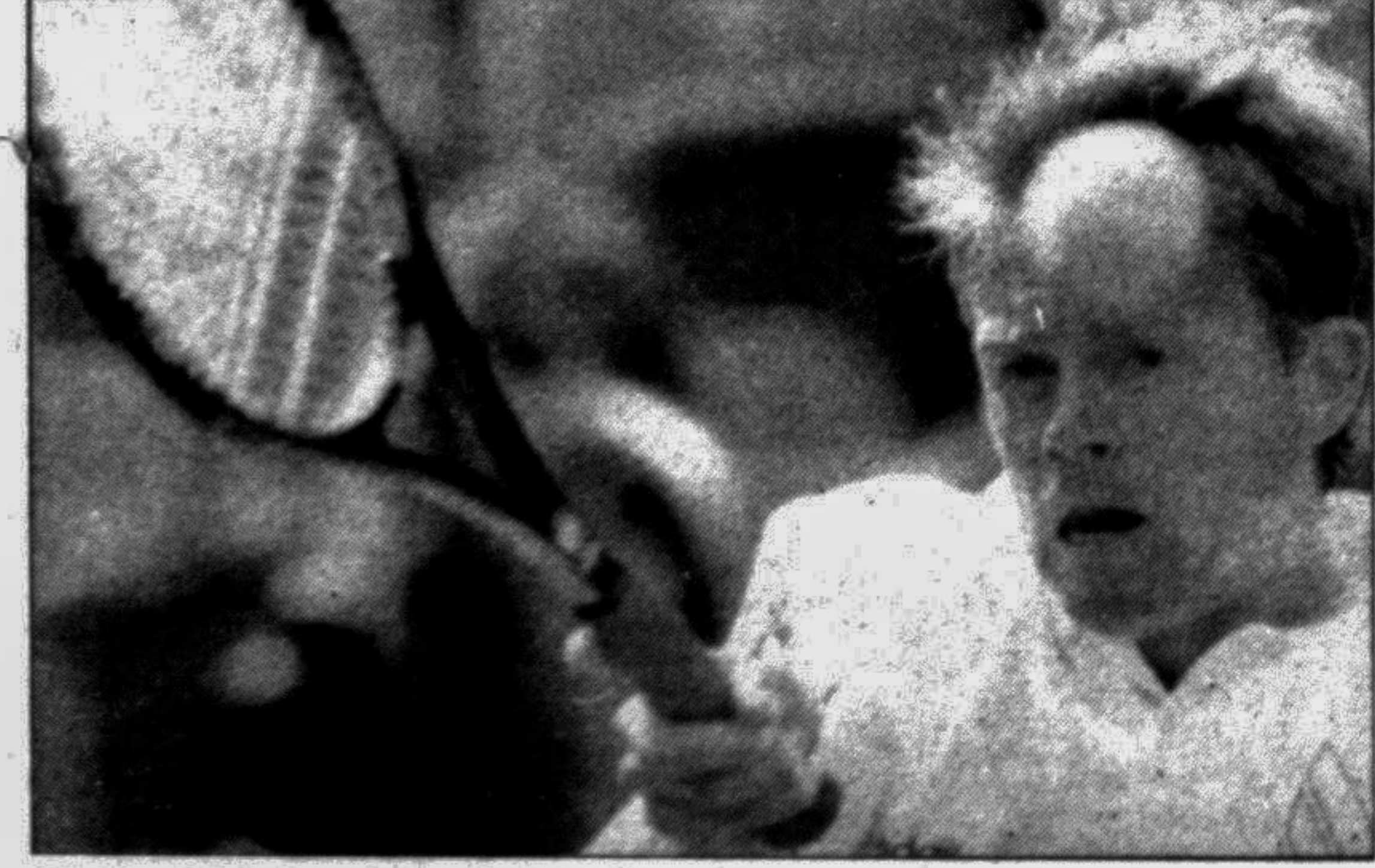
World number three Stefan Edberg of Sweden makes a powerful return to Uruguayan Marcelo Filippini during their second round match of the German Open in Hamburg on May 5. Edberg won 6-3, 6-3 to advance to the third round where he was eventually beaten by Spaniard Emilio Sanchez.

An Oldham victory and a Crystal Palace loss at Arsenal would send Palace down. Sheffield United and Ipswich could