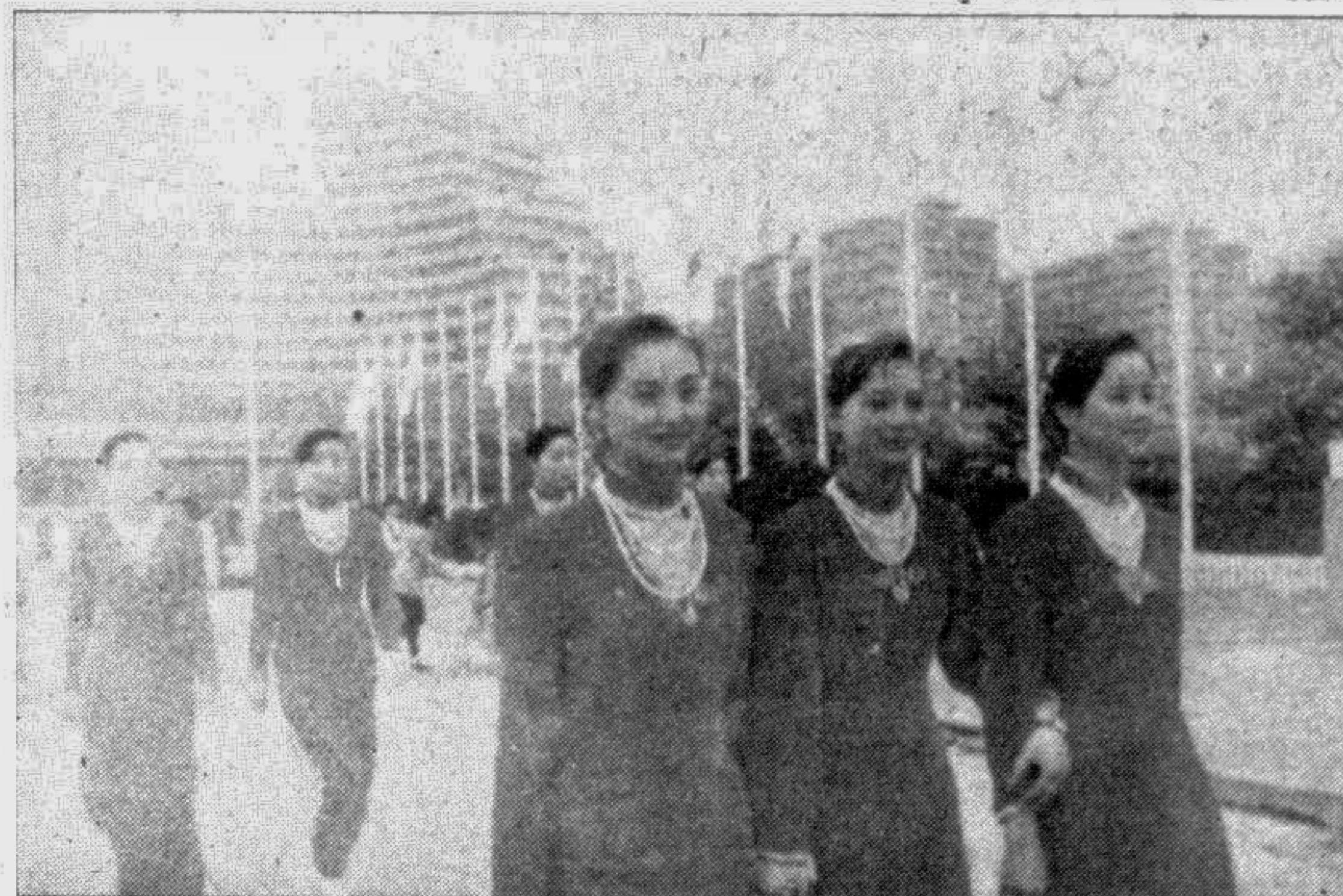
Hostesses for the first East Asian Games pass the Olympic and national flags as they leave Shanghai Stadium following the Chinese Taipei flag-raising ceremony yesterday. The young receptionists, aged 17 to 19, are students of the Shanghai Tourism Training School.

The crucial Saturday match will be Monaco's game at third place Paris St Germain, while Marseille visit lowly Caen.