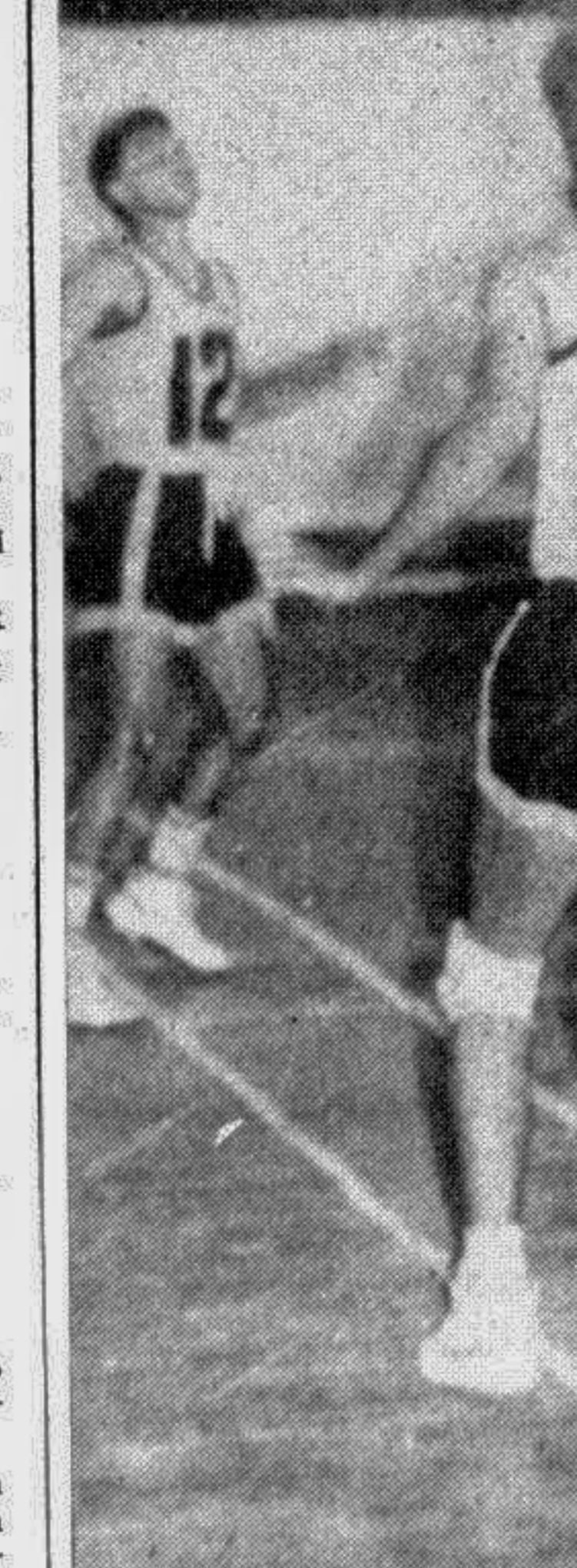
Scene from yesterday's BGIC Second Division basketball league match between Rangers Club and Mitford Friends Club at the Outer Stadium wooden-floor gymnasium. Rangers won the match 65-41.