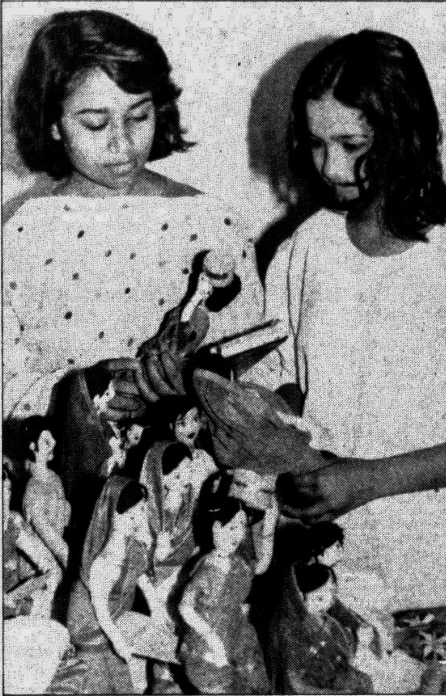
Bangladesh Federation of University Women arranged a Baishakhi Mela at the Dhaka Business and Professional Women's Club in the city yesterday.

The exhibition comprised works, which were a selection of the artist's last 20 years' work, in water colour on silk, and canvas. It is always a welcome change to be able to view the works of visiting artists and to learn from them.