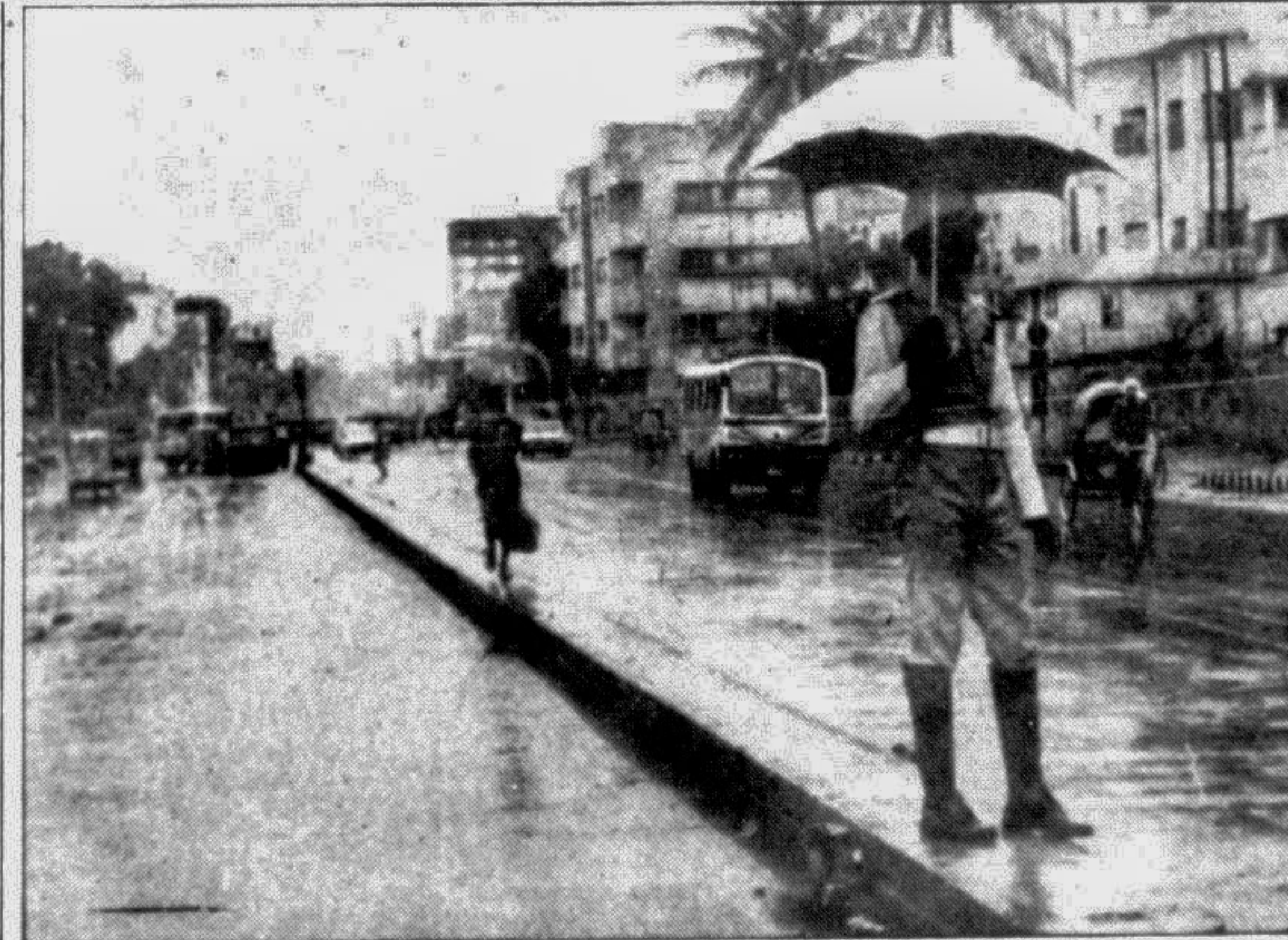
City roads wore an empty look yesterday because of the heavy downpour throughout the day.