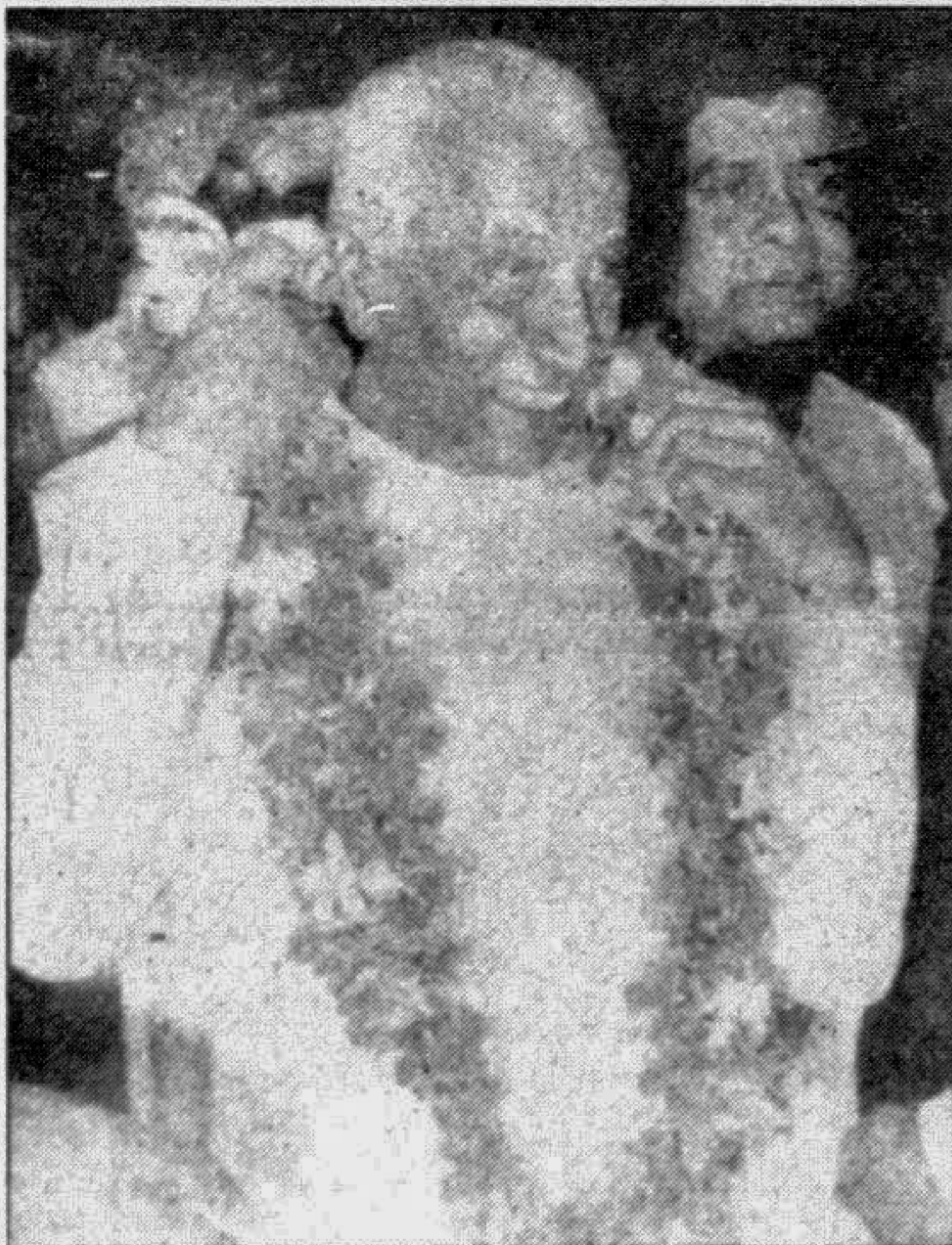
Wijetunga removes a flower garland after he was unanimously elected President yesterday.

COLOMBO, May 7: Sri Lanka's new President Dingiri Banda Wijetunga was sworn in Friday and vowed to unify this strife-torn island republic, respect human rights, and stamp out violence and intolerance, reports AFP.