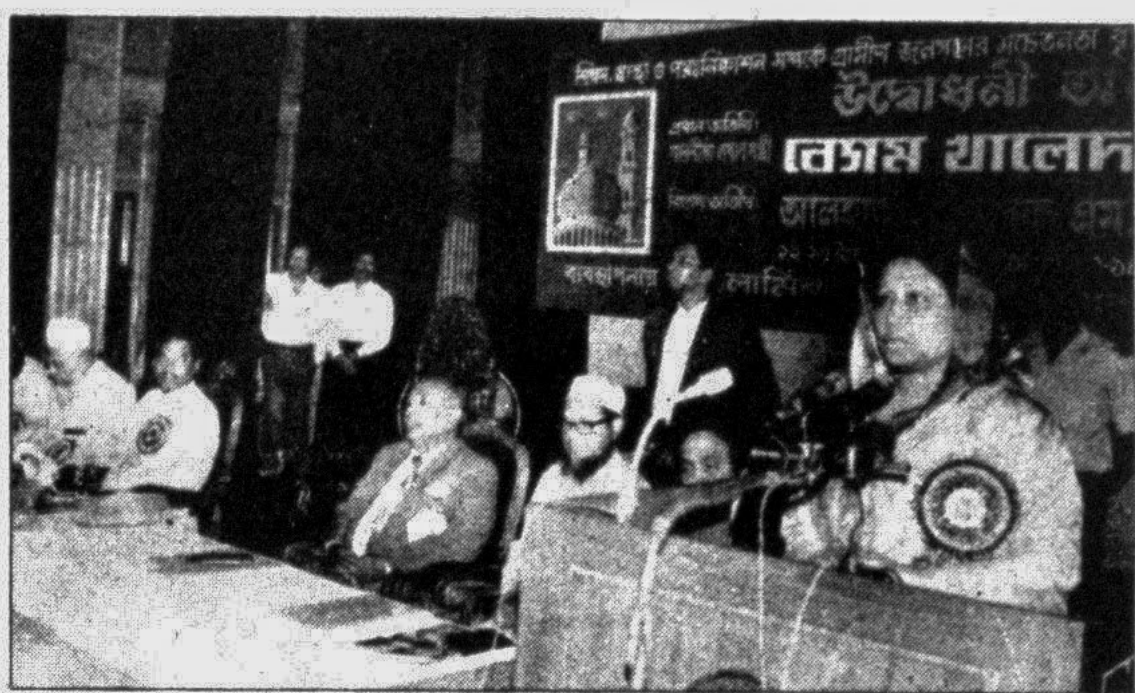
Prime Minister Begum Khaleda Zia inaugurating a two-day workshop on the Role of Imams in Increasing Awareness of the Rural People jointly organised by the Islamic Foundation, Bangladesh and UNICEF at the Institution of Engineers auditorium yesterday.