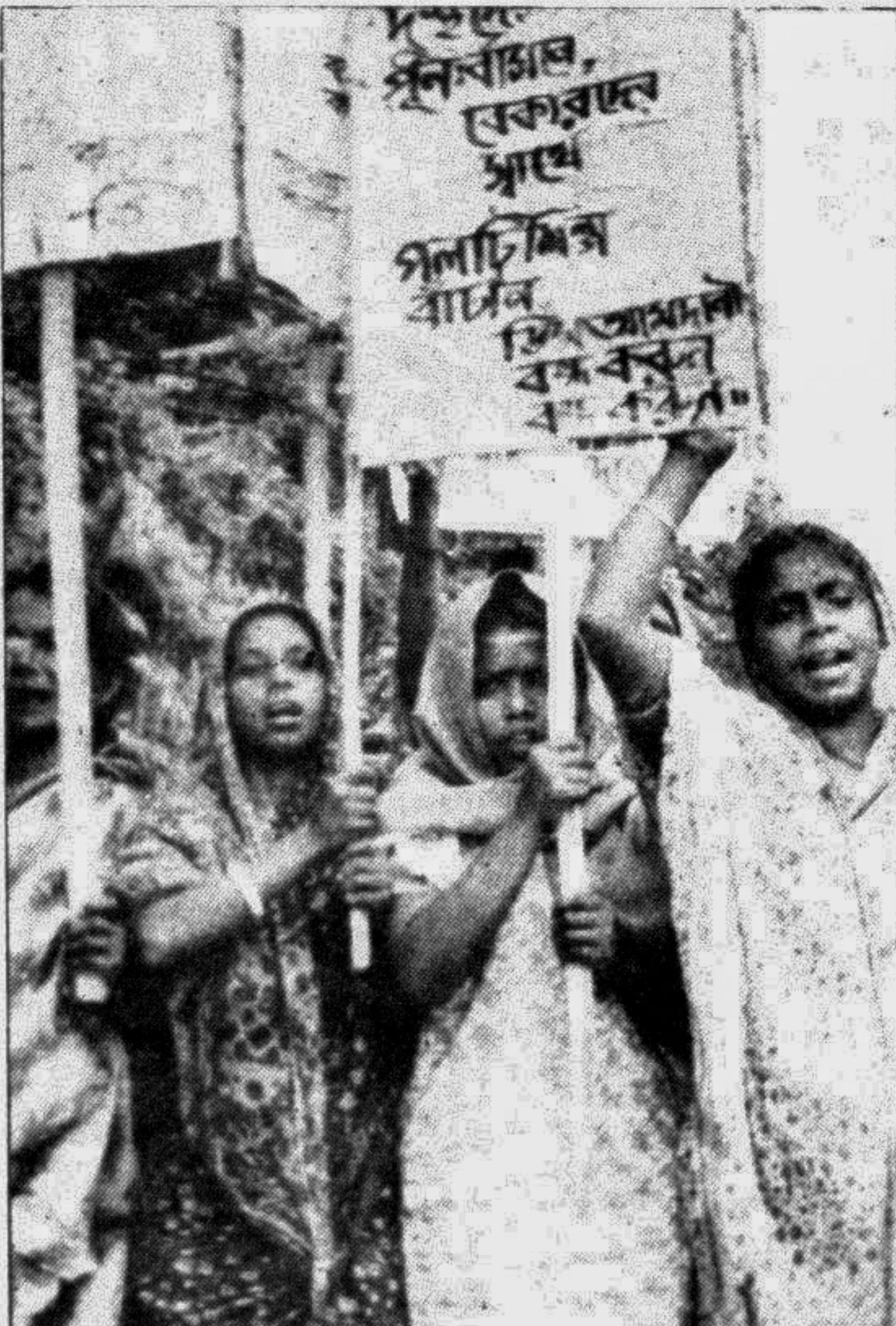
The owners and employees of poultry farms brought out a procession in the city yesterday demanding ban on the import of Indian eggs.